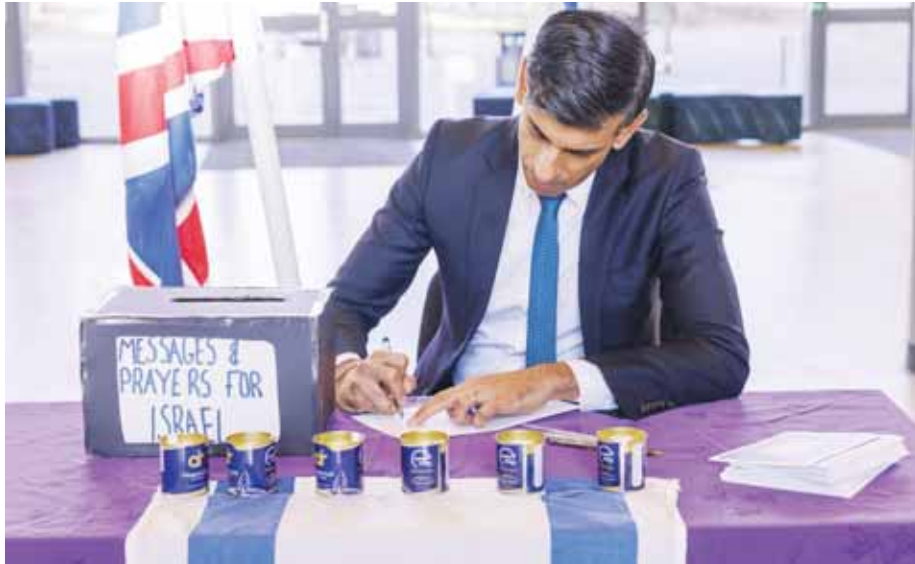
Britain's Prime Minister Rishi Sunak signing messages and prayers for Israel during a visit to a school in north London, England Monday.

"Today I met students and staff at a Jewish school in London to show my solidarity with the community. I am doing everything in my power to keep Jewish people in the UK safe, including through extra @CST_UK funding," Sunak said in a post on social media platform X. "Antisemitism will not stand," he added.