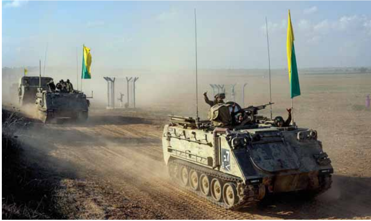
Israeli armored personnel carriers head toward the border with the Gaza Strip in southern Israel