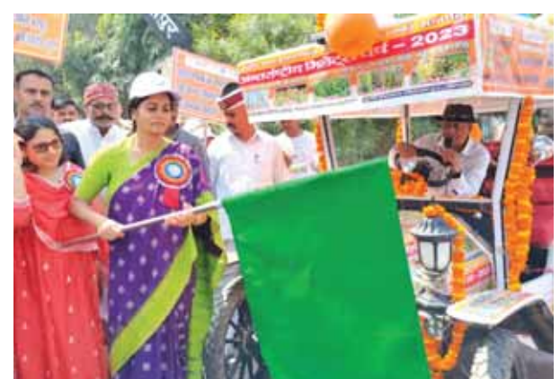
Union Minister of State for Commerce and Industry Anupriya Patel flagging off the millet awareness rally at Vikas Bhawan on Sunday

Flagging off the awareness rally taken out by the Agriculture department the minister appealed to farmers to