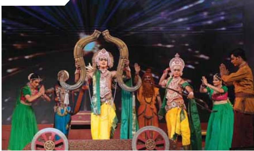
Artists perform during the annual presentation 'Shri Ram', a dance drama on Sampoorna Ramayana, in New Delhi