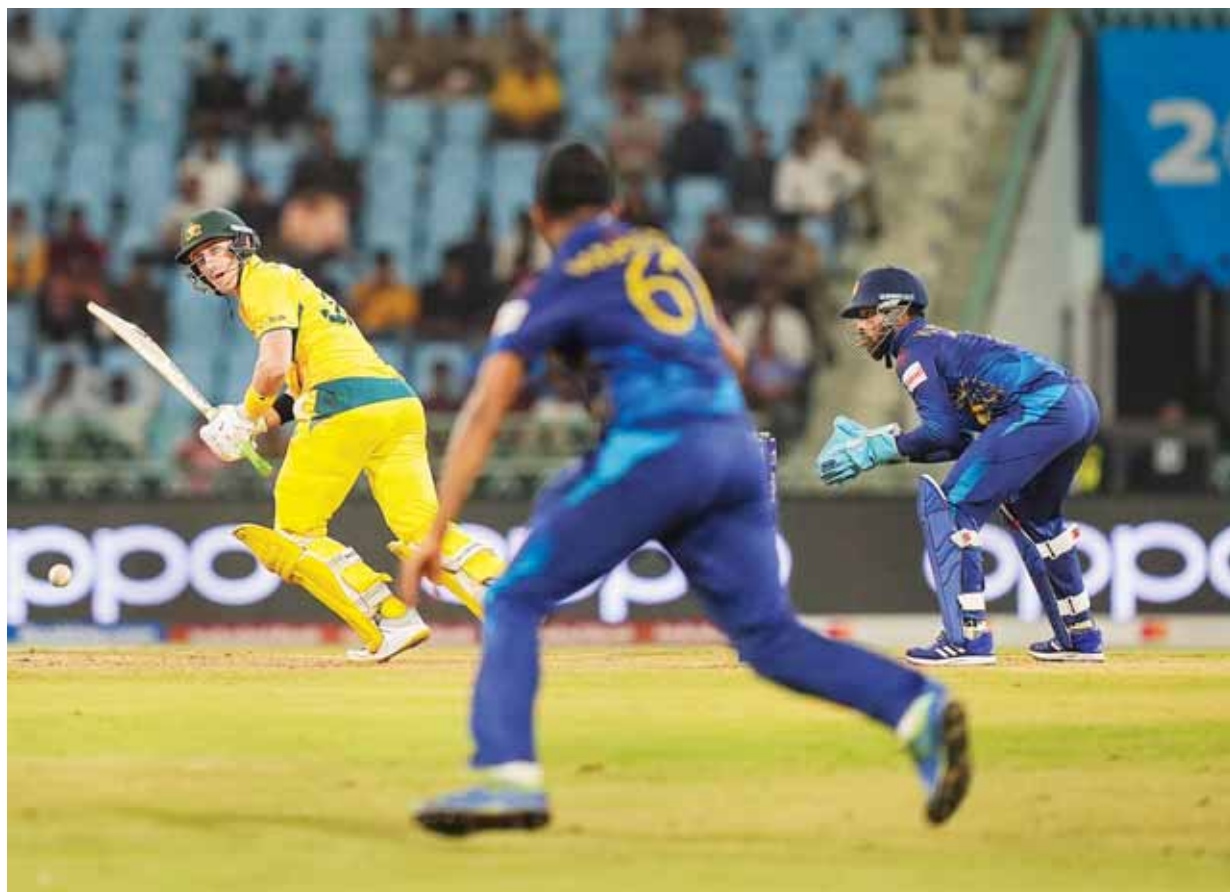
Australia's batter Marnus Labuschagne plays a shot during the ICC Men's Cricket World Cup 2023 match between Sri Lanka and Australia at Bharat Ratna Shri Atal Bihari Vajpayee Ekana Cricket Stadium in Lucknow on Monday. Australia beat Sri Lanka by five wickets in their ICC World Cup match here on Monday. Sent in to bowl, Australia dismissed Sri Lanka for 209 in 43.3 overs and then returned to overhaul the target in 35.2 overs, scoring 215 for five in a match that was briefly interrupted by rain. This was Australia's first win of the ongoing tournament.

expedite the retrieval of misplaced belongings. If passengers inadvertently leave their items on RAPIDX trains or within station premises, they can promptly seek assistance from station staff. Further inquiries and support regarding lost items can be directed to the RAPIDX Customer Service Centre at 08069651515. Passengers will have a 24-hour window to claim their lost belongings from the station where they were misplaced or left. Following this period, any unclaimed items will be transferred to the designated "lost and found" centre at the Ghaziabad station, operational from 8 am to 8 pm daily. The RRTS trains have been designed with an aerodynamic profile, featuring long noses and plug-in doors to minimize air resistance at higher speeds. Passengers will relish panoramic views through expansive window panes, enhancing their travel experience.