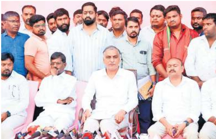
Minister for Finance T Harish Rao speaking to the media in Siddipet on Monday

cerned, the party always acted against the interests of the State. The saffron party leaders were spreading misinformation against the State government and Telangana. It was facing a dearth of candidates and was afraid of facing elections.