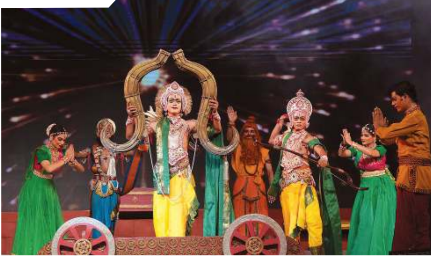
Artists perform during the annual presentation 'Shri Ram', a dance drama on Sampurna Ramayana, in New Delhi