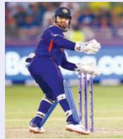
An 8-0 verdict against Pakistan in World Cup matches has proven that the team from our neighborhood is not up to the challenge at this level. Even the Pakistan hockey team went

down tamely without a semblance of a fight in the Asian Games. The toss proved vital in the ODI games, and after losing it, the team was progressing at a slow pace. As the team across the border failed to accelerate the scoring, danger lurked. Once Babar, the star batsman, was out, the wickets started tumbling, and the end was in sight. Instead of boosting their scoring with pinch hitters to upset Indian spin bowling, the lower-order batsmen fell into the trap and perished. The Indian batting did not retreat against Afridi but instead wielded the willow with great effect, hitting fours and sixes, bringing the target within reach. Captain Rohit Sharma's batting and his ability to handle both bowlers and field placements received appreciation. In the end, Pakistan was soundly defeated. However, Pakistan has had a great tradition of cricket and this is not the end of it as they can and will bounce back to the height they once were.