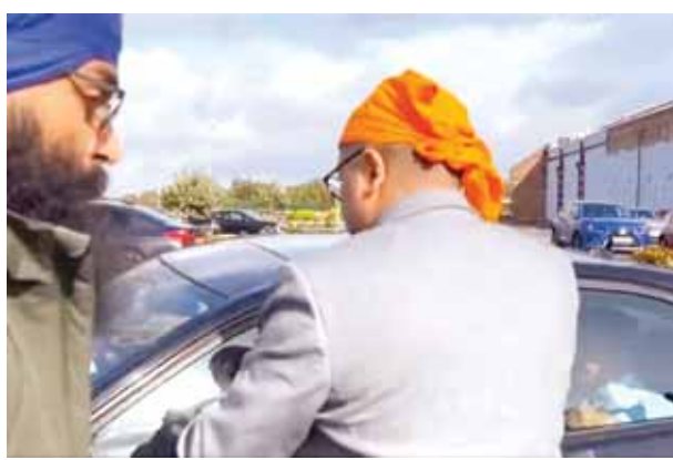
Khalistanis block the car of Indian High Commissioner to the UK Vikram Doraiswami from entering a gurdwara in Glasgow on Saturday

The safety and security of foreign diplomats is of utmost importance, and our places of worship in the UK must be open to all," Anne-Marie Trevelyan said in a post on X. The gurdwara committee and local community leaders have expressed their regret over the incident and have called on the authorities to take action against the culprits. The local police said it was called to the "disturbance", and its enquiries remain ongoing. "We were called around 1.05 pm on Friday, 29 September, to a report of a disturbance that happened in the Albert Drive area of Glasgow. There were no reports of any injuries, and enquiries are ongoing to establish the full circumstances," said a Police Scotland spokesperson. The incident follows a diplomatic standoff over the issue of pro-Khalistan extremism after Canadian Prime Minister Justin Trudeau's statement in the country's Parliament last week that the authorities are "actively pursuing credible allegations" related to Indian government involvement in the murder of Hardeep Singh Nijjar, a designated terrorist, allegations which the Ministry of External Affairs has strongly rejected as "absurd and motivated". "This is exactly how we should be greeting any Indian ambassador, anyone from the Indian government who comes in an official capacity under any excuse of doing visa applications or whatever it might be," a Sikh man is heard saying in a video posted on social media