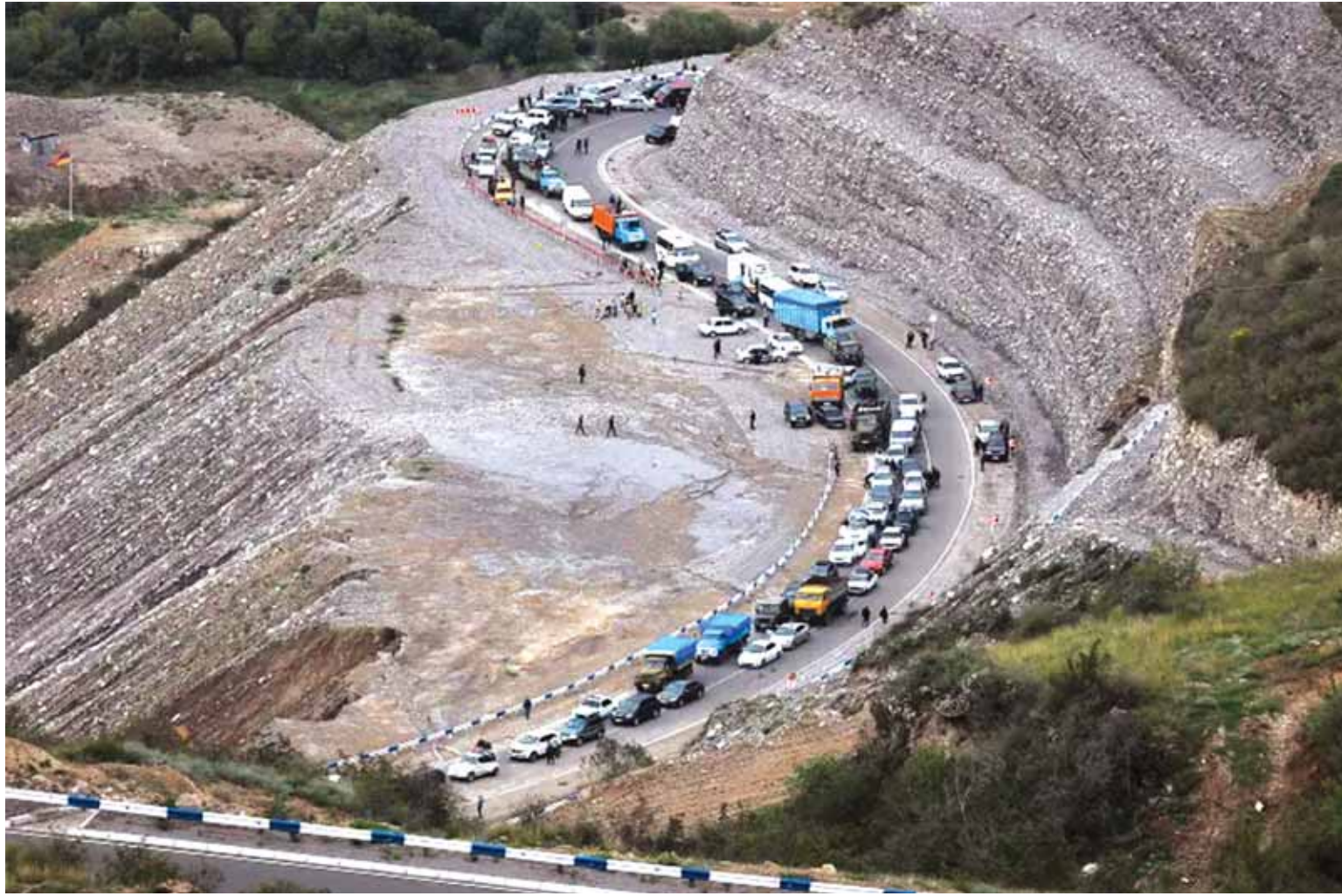
A convoy of cars of ethnic Armenians from Nagorno-Karabakh moves towards Komidzor in the Syunik region in Armenia

Meanwhile, the Nagorno-Karabakh oblast declared independence, leading to intense fighting between Armenia and Azerbaijan. By 1993, the Armenian security forces had occupied the region and also gained control over 20 per cent of the neighbouring Azerbaijani territory. In 1994, Boris Yeltsin, the first leader of the Russian Federation, successfully negotiated a peace deal known as the Bishkek Protocol between the two former Soviet Republics.