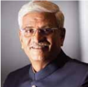
Gajendra Singh Shekhawat

The SHS campaign has acted as a catalyst in enabling public participation towards a cleaner, healthier & more sustainable India