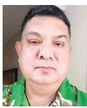
Jayanta Mahapatra in "All The Poetry There is"

Poetry and poetic experiences are strange phenomena. That was the precise reason Plato banned poets from entering his ideal Republic. Athenian society, at the zenith of rationality, offered poison to Socrates. Socrates's fault was his belief in the power of scrutiny, of judgement. He found "an unexamined life is not worth living." Genuine poets pierce through the layers "an unexamined life" is made of and then let gathered clouds in their minds get scattered by the sunlight of their musings.