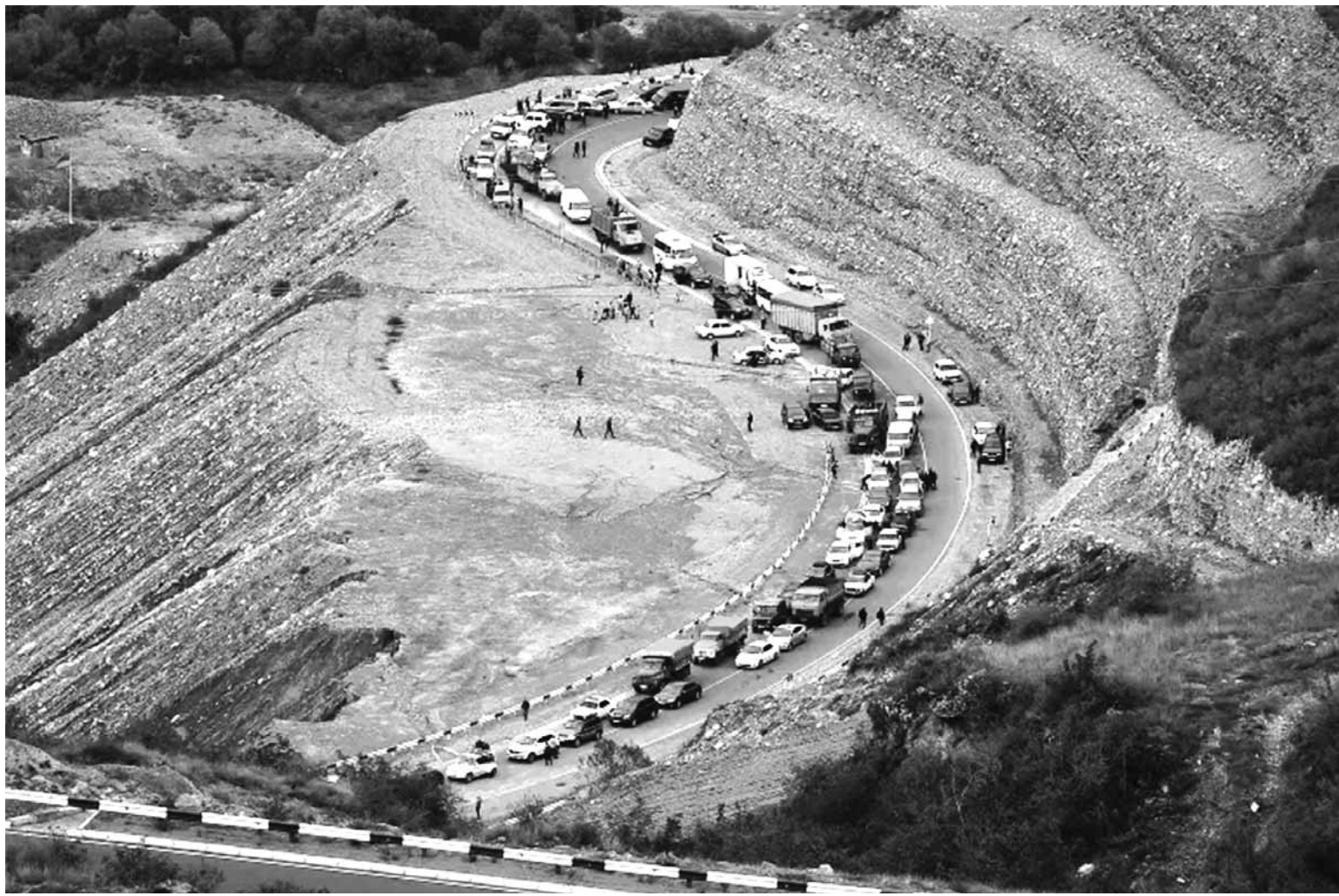
A convoy of cars of ethnic Armenians from Nagorno-Karabakh moves towards Komridzor in the Syunik region in Armenia

Meanwhile, the Nagorno-Karabakh oblast declared independence, leading to intense fighting between Armenia and Azerbaijan. By 1993, the Armenian security forces had occupied the region and also gained control over 20 per cent of the neighbouring Azerbaijani territory. In 1994, Boris Yeltsin, the first leader of the Russian Federation, successfully negotiated a peace deal known as the Bishkek Protocol between the two former Soviet Republics.