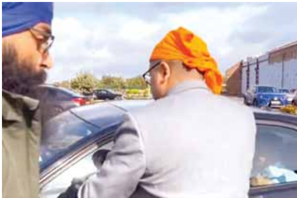
Khalistanis block the car of Indian High Commissioner to the UK Vikram Doraiswami from entering a gurdwara in Glasgow on Saturday

"This interaction was to discuss community and consular issues. The organisers included senior community leaders, ladies and Committee members, and a member of (the) Scottish Parliament. They were threatened and abused by these elements..."