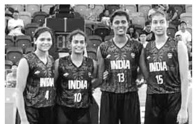
while facing a humiliating defeat against last edition's gold medallist China. The women's team will lock horns with Chinese Taipei in the quarterfinals.