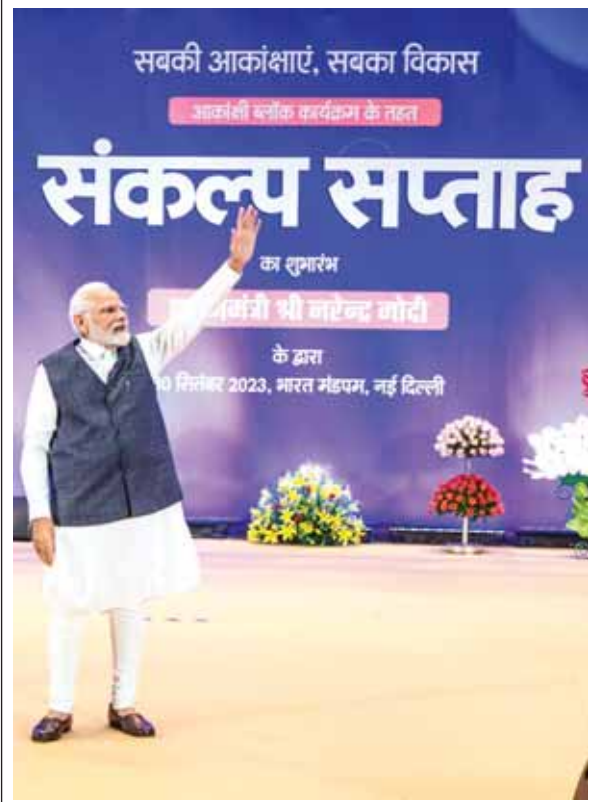
Prime Minister Narendra Modi during the launch of a week-long programme for Aspirational Blocks titled 'Sankalp Saptah' at Bharat Mandapam in New Delhi on Saturday

"We don't need to learn from other people what freedom of speech is about. But we can tell people this. We don't think freedom of speech extends to incitement, to violence. That to us is a misuse of freedom," he emphasised.