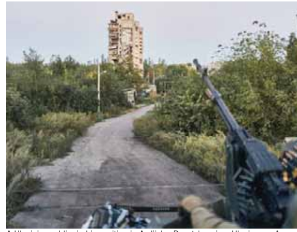
A Ukrainian soldier in his position in Avdiivka, Donetsk region, Ukraine, on August 18, 2023. Russia is throwing more units into its effort to take this key eastern Ukraine city, Western analysts say, after apparent setbacks that have slowed its dayslong onslaught.

Russia is throwing more units into its effort to take a key eastern Ukraine city, Western analysts say, after apparent setbacks that have slowed its dayslong onslaught.