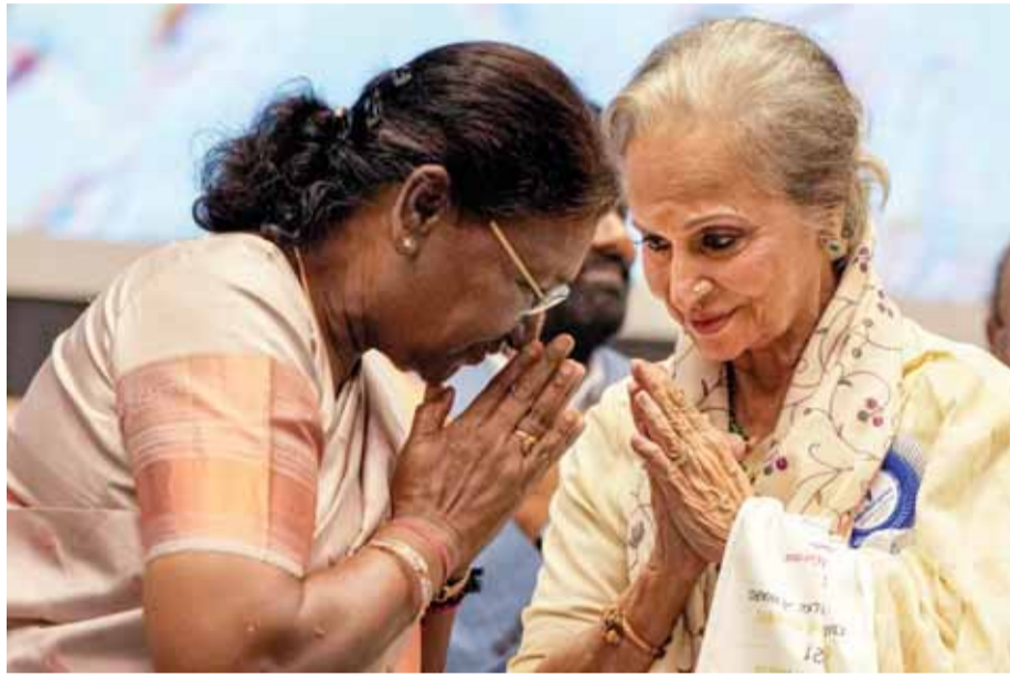
President Droupadi Murmu after presenting the Dadasaheb Phalke Award to actor Waheeda Rehman during the 69th National Film Awards at Vigyan Bhawan in New Delhi on Tuesday

"...Which is why I am sharing this award with all the departments of the film industry. They gave me a lot of respect, support and love from the