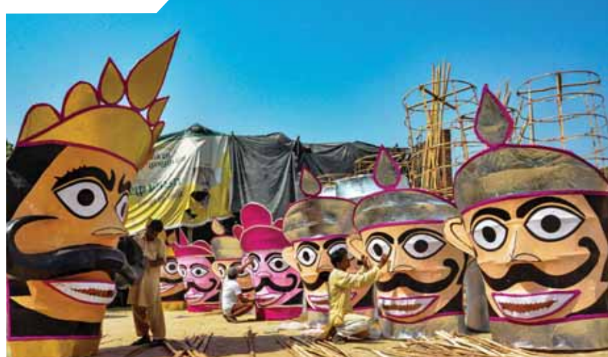
Artisans prepare effigies of demon King Ravana ahead of the Dussehra festival, in Rampur