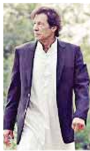
Monday (October 23), Geo News reported. "On October 23, the charges will be framed and the indictment will be filed. After the indictment, the regular trial of the cipher case will begin," he said.