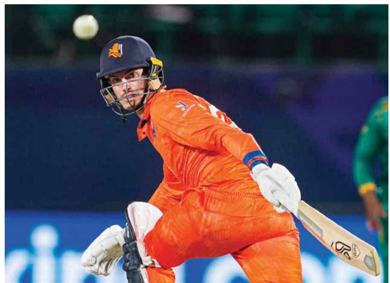
Netherlands captain Scott Edwards plays a shot during the ICC Men Cricket World Cup 2023 match between South Africa and Netherlands at HPCA Stadium in Dharamshala on Tuesday