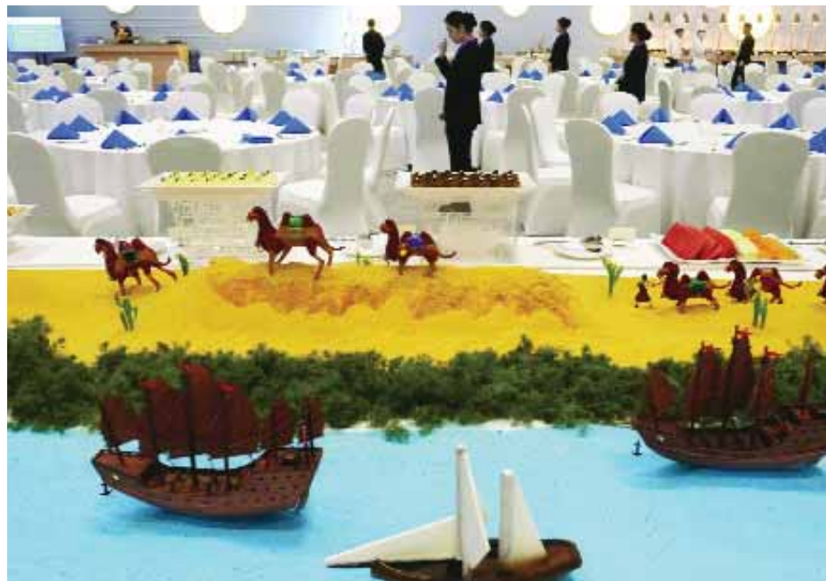
Waitresses prepare for meal time at the media center near a display depicting China's Silk Road during the Third Belt and Road Forum held at the China National Convention Centre in Beijing, on Monday

The leaders who arrived on Monday included Ethiopian