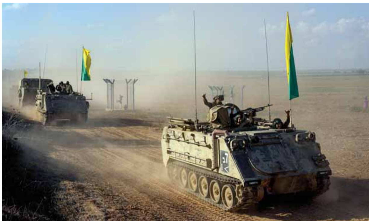
Israeli armored personnel carriers head toward the border with the Gaza Strip in southern Israel