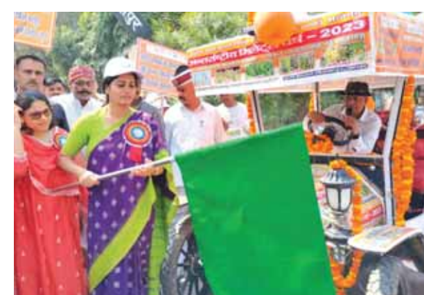
Union Minister of State for Commerce and Industry Anupriya Patel flagging off the millet awareness rally at Vikas Bhawan on Sunday

Flagging off the awareness rally taken out by the Agriculture department the minister appealed to farmers to