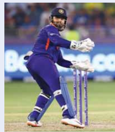
An 8-0 verdict against Pakistan in World Cup matches has proven that the team from our neighborhood is not up to the challenge at this level. Even the Pakistan hockey team went

down tamely without a semblance of a fight in the Asian Games. The toss proved vital in the ODI games, and after losing it, the team was progressing at a slow pace.