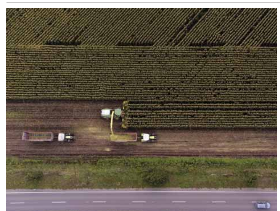
A harvesting machine mows down rows of corn in fields near Dingelstaedt, Germany, on Monday