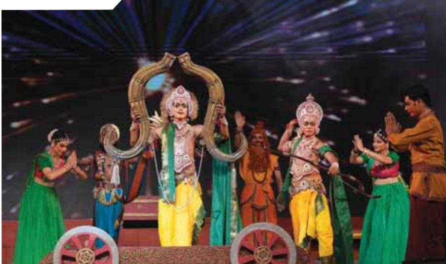
Artists perform during the annual presentation 'Shri Ram', a dance drama on Sampurna Ramayana, in New Delhi