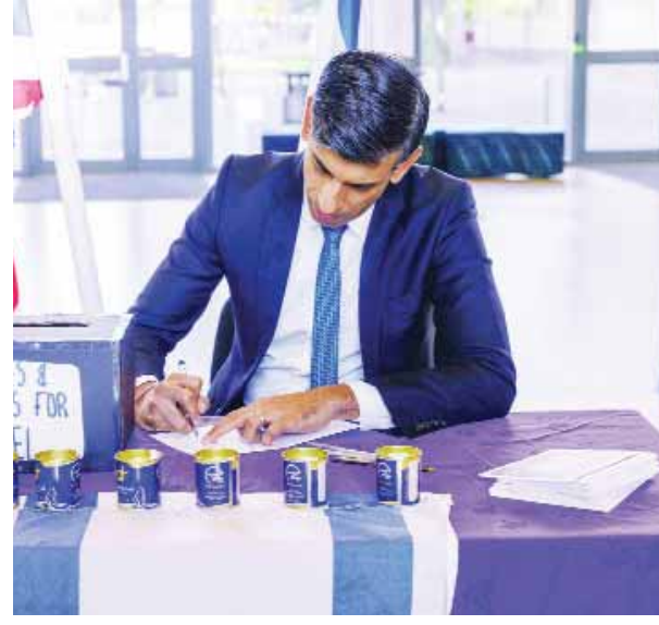
Britain's Prime Minister Rishi Sunak signing messages and prayers for Israel during a visit to a school in north London, England Monday.

Prime Minister Rishi Sunak on Monday visited a Jewish school here and reiterated his government's commitment to protect Britain's Jews from antisemitic attacks amid the ongoing Israel-Gaza conflict. The British Indian leader also stressed that Israel's operations must centre on the terrorist group Hamas to avoid an escalation of conflict in the region. He pointed to the spy planes deployed by the UK to the eastern Mediterranean region to monitor and prevent arms shipments from landing in terrorist hands. "I'm determined to ensure that our Jewish community is able to feel safe on our streets, that there is no place in our society for antisemitism, and we will do everything we can to stamp it out and where it happens," said Sunak during his visit to the Jewish school in north London. He attended an assembly at the secondary school before answering a few questions from those present. "I stand with all of you, the Jewish community, not just today, tomorrow but always, and I really mean it. Like many of you, I am different; I come from a different background, and our society is strongest when that diversity is respected. There are people who are trying to stir up hatred and division, and I will always strive very hard to protect that diversity," he said.