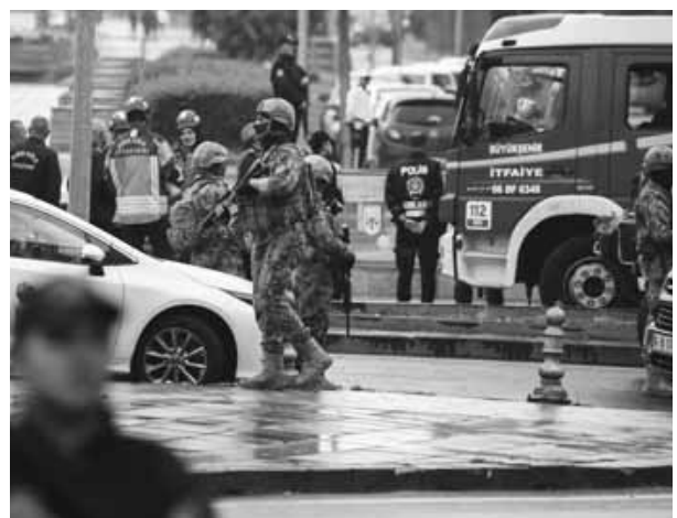
Turkish security forces cordon off an area after an explosion in Ankara, Sunday. A suicide bomber detonated an explosive device in the heart of the Turkish capital, Ankara, on Sunday, hours before parliament was scheduled to reopen after a summer recess. A second assailant was killed in a shootout with police.

Police cordoned off access to the city center and increased security measures, warning citizens that they would be conducting controlled explosions of suspicious packages. The two police officers were being treated in a hospital and were not in serious condition, Yerlikaya said.