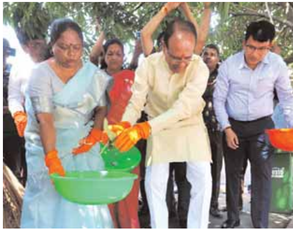
Minister Sheri Narendra Modi also launched the Swachhata Bharat Abhiyan after becoming the Prime Minister in 2014. On the call of Prime Minister Sheri Modi, he offered

Chief Minister Shivraj Singh Chouhan offered shramdaan in the Swachhata Hi Seva - Cleanliness is the Real Service Campaign in Bhopal Haat Bazaar. He participated in the 'Ek Tareekh-Ek Ghanta-Ek Saath' programme. He cleaned the premises. The Chief Minister Chouhan gave a message of cleanliness to the people saying that Cleanliness is the Real Service. He said that God Resides Where Cleanliness Prevails. Underlining the importance of cleanliness, Chief Minister Sheri Chouhan said that cleanliness brings good health and happiness. Father of the Nation Mahatma Gandhi always laid emphasis on cleanliness. The Prime