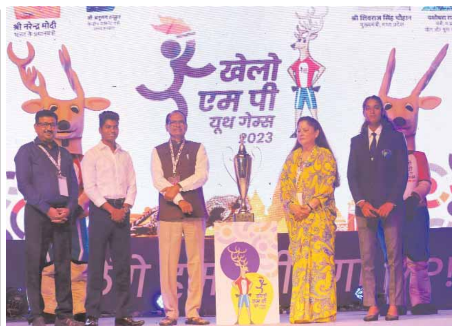
Madhya Pradesh Chief Minister Shivraj Singh Chouhan with Minister for Sports and Youth Welfare Yashodhara Rajee Scindia unveils a trophy during the opening ceremony of 'Khelo MP Youth Games-2023' at TT Nagar Stadium in Bhopal on Sunday.

on PRV 4757, one of whom was a constable, and the other a home guard," said the ACP. "The constable was immediately suspended, and the department was notified for disciplinary action against the home guard. Information about a third individual involved in the incident was also obtained, and the police are taking preliminary legal actions in that regard," the ACP added. Upon complaint, the three were booked under IPC sections 354a (1)(ii) for physical contact and advances involving explicit sexual overtures and demand for sexual favours, 323 for voluntarily causing hurt, 504 for intentional insult and 342 for wrongful confinement besides levying the provisions of the Prevention of Corruption Act at Kotwali police station on September 28.