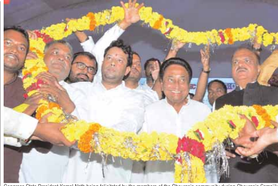
Congress State President Kamal Nath being felicitated by the members of the Chourasia community during Chourasia Samajik Mahakumbh at BHEL Dussehra Ground in Bhopal on Sunday.