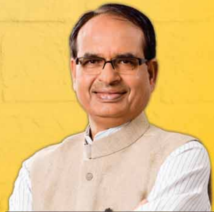
शिवराज सिंह चौहान, मुख्यमंत्री

मल्टी मॉडल लॉजिस्टिक पार्क, इंदौर विभिन्न परिवहन सेवाओं की एकीकृत सुविधा के निर्माण से औद्योगिक विकास को प्रोत्साहन एवं 15 लाख प्रत्यक्ष और अप्रत्यक्ष रोजगारों का सृजन