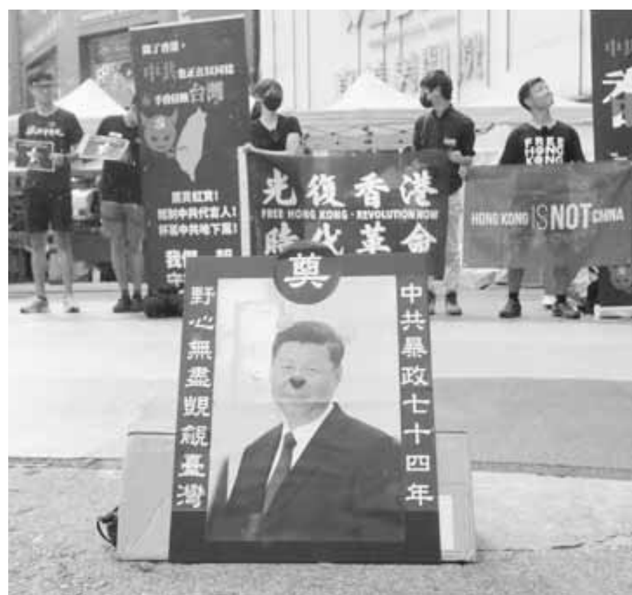
A portrait of Chinese President Xi Jinping is placed in front of Hong Kong activists living in Taiwan during a protest on China's National Day in Taipei, Taiwan, on Sunday