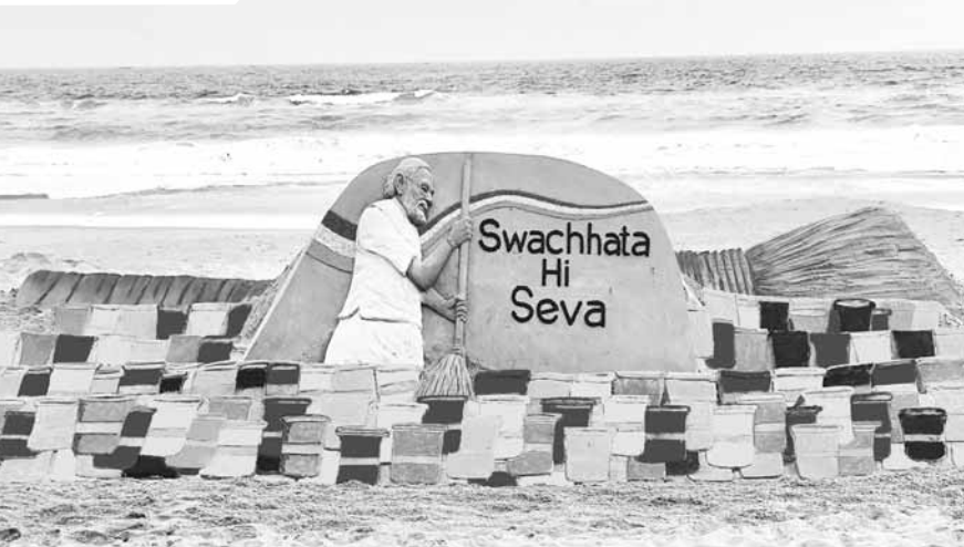
A sand sculpture created by sand artist Sudarsan Pattnaik on the 'Swachhata Pakhwada at Puri beach