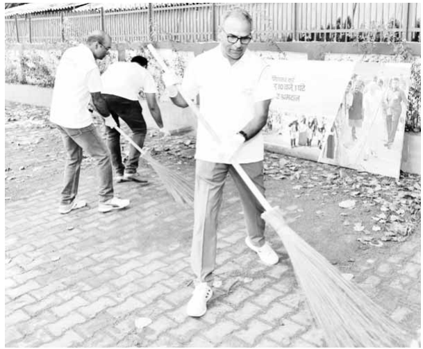
ness oath by GM to the officers and employees of the CORE. Under the clean office campaign, extensive cleaning was

The swachhta pakhwada started on September 16 with the administration of cleanli-