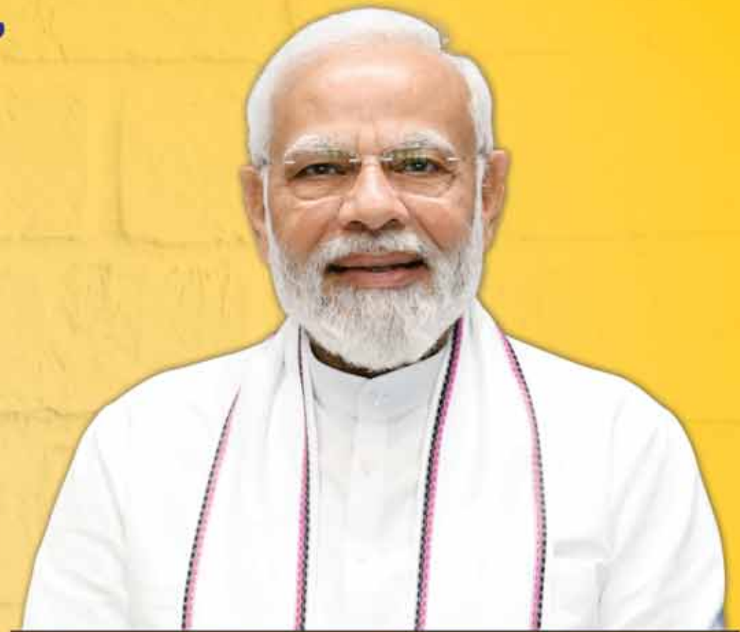
नरेन्द्र मोदी, प्रधानमंत्री