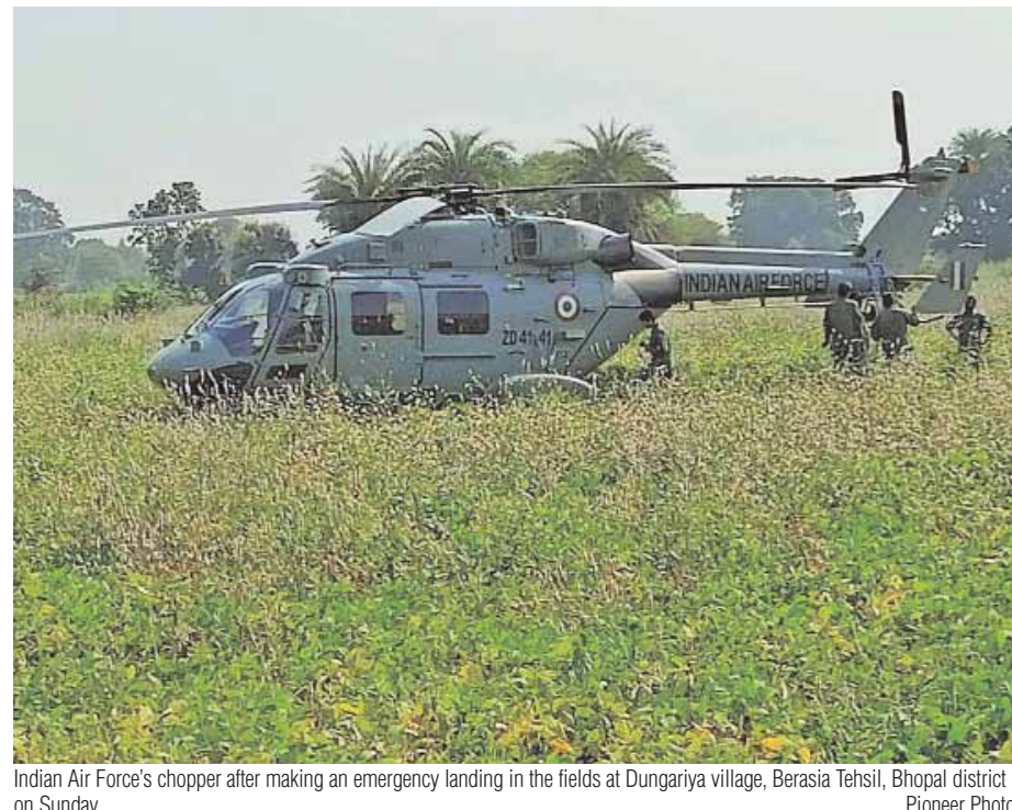
Indian Air Force's chopper after making an emergency landing in the fields at Dungariya village, Berasia Tehsil, Bhopal district on Sunday.