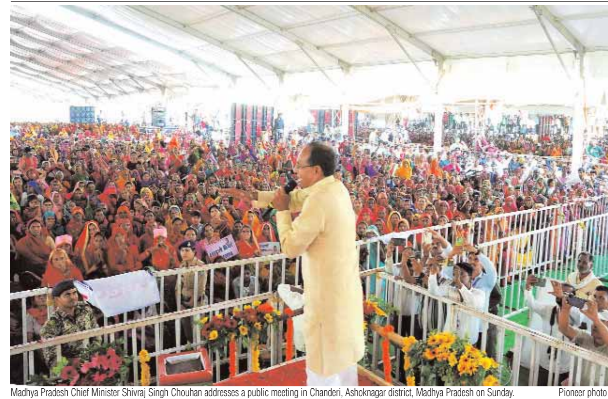
Madhya Pradesh Chief Minister Shivraj Singh Chouhan addresses a public meeting in Chanderi, Ashoknagar district, Madhya Pradesh on Sunday.

30, whereas 37.38 inches of water was expected to fall. Accordingly, rainfall has reduced by 0.4 percent. The eastern part has received 4% less rainfall and the western part has received 3 percent more rainfall. The rainfall figure in Narsinghpur is more than 51 inches. It has rained the most here. Jabua, Burhanpur, Kargone, Narsinghpur, Seoni, Niwari, Ratlam, Bhind, Ujjain, Rajgarh, Dhar, Alirajpur, Barwani, Khandwa, Katni, Chhindwara, Dewas, Sheopur, Harda, Betul and Anuppur districts have received more than normal rainfall. Jabalpur, Sehore, Mandla, Balaghat, Dindori, Shivpuri, Datia, Sagar, Tikamgarh, Neemuch, Agar-Malwa, Morena and Shahdol districts have received more than 90 percent rainfall than normal.