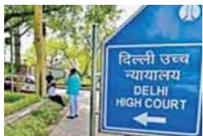
allotted to the Eknath Shinde faction by the Election Commission by a recent order.

Shewale, who is the leader of Shiv Sena in the Lok Sabha, moved Court alleging that Raut had said that there was a deal of Rs. 2000 crore following which the Shiv Sena name and bow and arrow symbol was