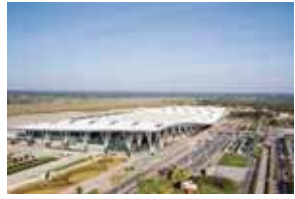
no such activity was being executed.

With this development, the construction of the proposed airport is likely to be delayed much to the chagrin of the Karnataka Government which is keen to flag off the project by March so that it can be inaugurated before the Election Commission Model Code of Conduct is imposed on the State.