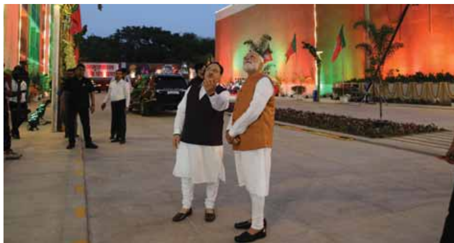
Prime Minister Narendra Modi, with BJP national president JP Nadda, arrives to inaugurate the newly-constructed BJP Central Office (Ext), in New Delhi on Tuesday

Former Vice-President M Venkaiah Naidu on Tuesday said it was unfortunate that Savarkar's name was being "blackened needlessly" by those who seem to be ignorant of his "matchless sacrifice" during the freedom struggle.