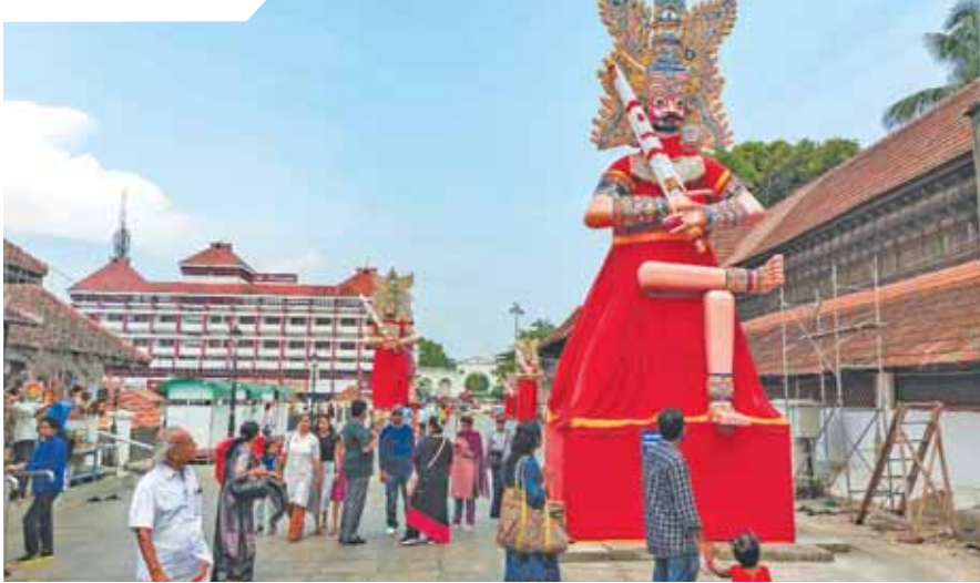
Idols of the Pandavas, erected as part of preparations for 'Painkuni' festival, Thiruvananthapuram