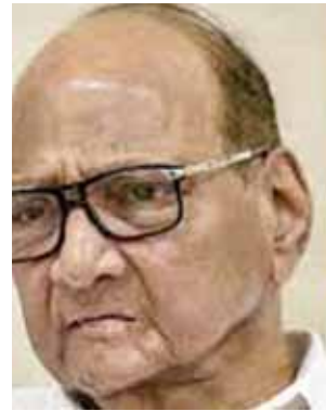
ideologue V D Savarkar's "insult" by Congress leader Rahul Gandhi.

Maharashtra BJP chief Chandrashekhar Bawankule dared Uddhav Thackeray to walk out of MVA if he really cannot tolerate late Hindutva