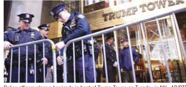
Police officers place a barricade in front of Trump Tower, on Tuesday in NY.

For 40 years, former President Donald Trump has navigated countless legal investigations without ever facing criminal charges. That record may soon come to an end. Trump could be indicted by a Manhattan grand jury as soon as this week, potentially charged with falsifying business records connected to hush money payments during his 2016 campaign to women who accused him of sexual encounters.