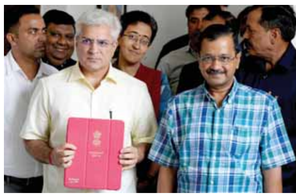
Delhi Chief Minister Arvind Kejriwal and Delhi Finance Minister Kailash Gahlot arrive for the presentation of Delhi Budget for the financial year 2023-24, at Delhi Legislative Assembly, on Wednesday

The Education Department has been given Rs 16,575 crore. In the 2022-23 Budget, it had the highest allocation of Rs 16,278 crore. An outlay of Rs 9,337 crore in the