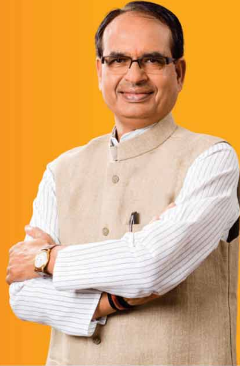
शिवराज सिंह चौहान मुख्यमंत्री, मध्यप्रदेश

3 साल बढ़े हैं सबसे आगे खड़े हैं देख रहा है सारा देश-सबसे आगे मध्यप्रदेश