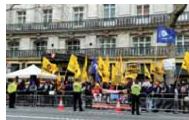
Protesters gathered outside a heavily guarded Indian High Commission in London.

The protesters, including turbaned men, and some women and children, had been bused in from different parts of the UK and chanted pro-Khalistan slogans. The organisers used mikes to make anti-India speeches and attack the