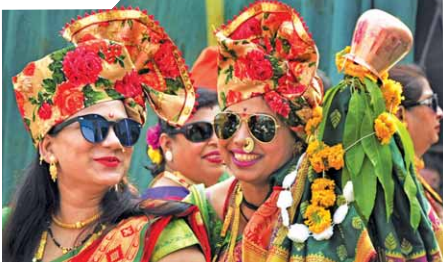
Women traditional attire celebrate Gudi Padwa festival, the beginning of Maharashtra New Year, in Nagpur