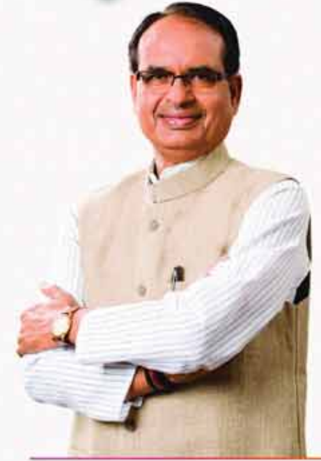
शिवराज सिंह चौहान मुख्यमंत्री, मध्यप्रदेश