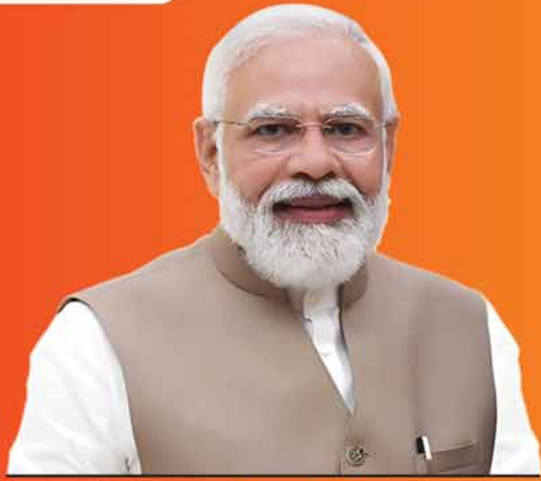
नरेन्द्र मोदी प्रधानमंत्री

3 साल बढ़े हैं सबसे आगे खड़े हैं देख रहा है सारा देश-सबसे आगे मध्यप्रदेश