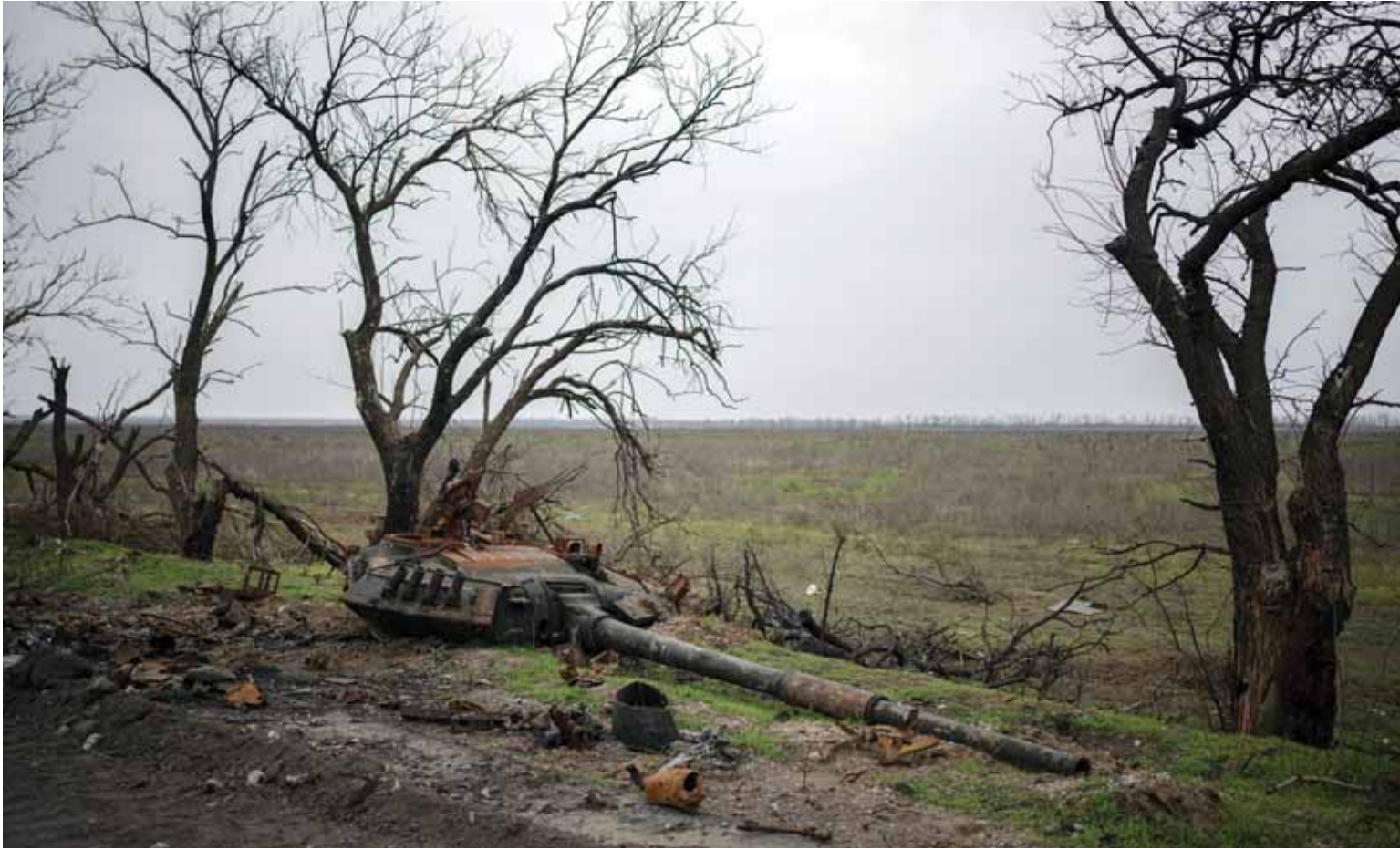
The turret of a destroyed tank is pictured outside Kalynivske, Ukraine, on Saturday, Jan 28

The statement coming from the high office also high-