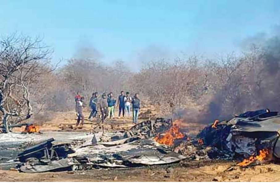
Locals near the wreckage of planes after a Su-30MKI and a Mirage 2000 fighter planes crashed during an exercise, in Morena district on Saturday

Sukhoi, Mirage jets crash near Gwalior; 2 SU-30 pilots eject, injured; probe begins