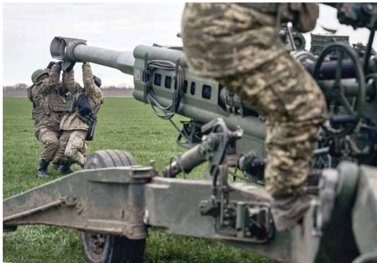
In this file photo, Ukrainian soldiers prepare a US-supplied M777 howitzer to fire at Russian positions in Kherson region, Ukraine, on Jan 9, 2023

A key problem, said one officer, is that Ukrainian troops are pushing the weapons to their limits — firing them at unprecedented rates and using them long after a US service