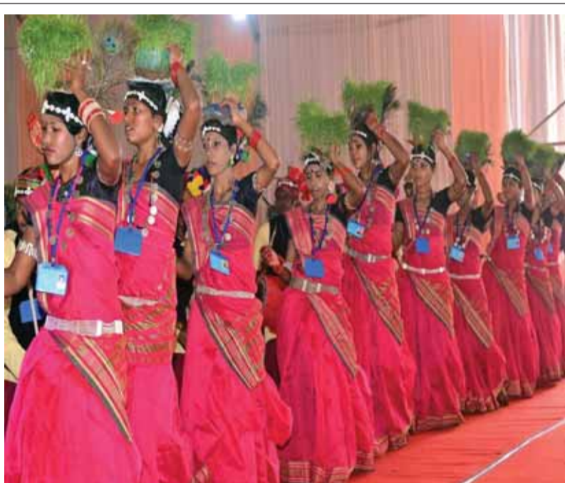
Different teams performed traditional dances at the three-day Chhattisgarh Youth Festival on Saturday at the Science College Ground, Raipur.