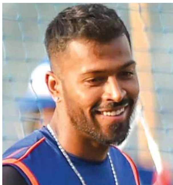
KISHAN, HOODA UNDER SCRUTINY

Skipper Pandya, however, is unlikely to bring in uncapped pace bowler Mukesh Kumar for the second T20I and will probably back Arshdeep to bounce back.