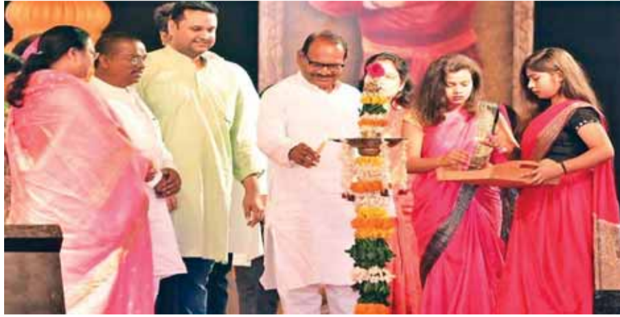
Festival. There are 24 cultural, six sports and seven other disciplines. The inaugural day began with cultural festivity. There were folk dance mainly Panthi and Danda (Durg division), Kaksar (Bastar), Raut Nacha and Danda (Bilaspur), Karma and Sarhul (Surguja) and Karma and Panthi dance (Raipur division). The winners will be selected in team and individual shows.