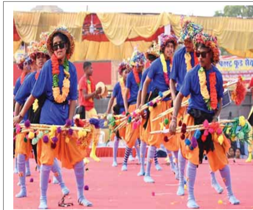
Different teams performed traditional dances at the three-day Chhattisgarh Youth Festival on Saturday at the Science College Ground, Raipur.