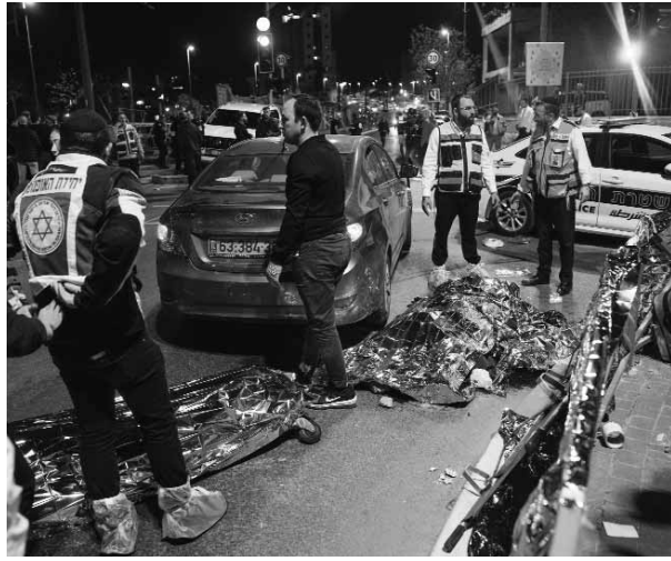
Victims of a shooting attack are covered on the ground near a synagogue in Jerusalem on Friday

Israel Prime Minister Benjamin Netanyahu, speak-