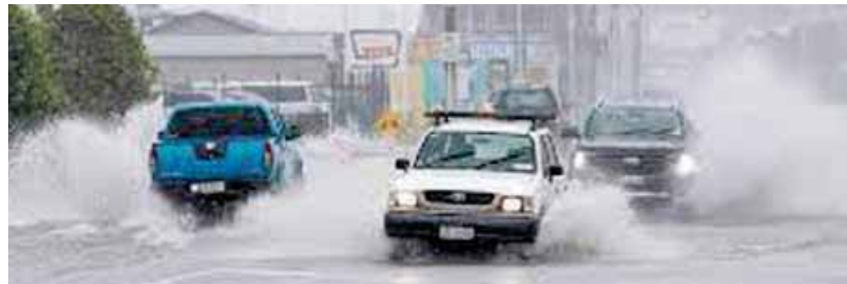
to stay put for a period of time, or if you have to evacuate." Earlier, the cyclone passed near remote Norfolk Island, a ter-

"Please do take this seriously, we do expect severe weather is on the way," New Zealand Prime Minister Chris Hipkins told reporters. "So please make sure that you're prepared. Make sure that you've got preparations in place for either if you have