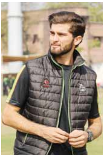
line-up which has the experience of Fakhar Zaman upfront. The combination of Afridi and

However, Lahore has drafted in Englishman Sam Billings and West Indian Shai Hoe to bolster its batting