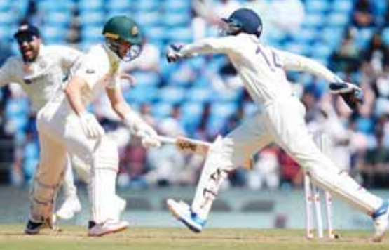
be nothing more than a fairly typical first-day Indian red-soil wicket," Chappell wrote.

"The noise was exactly that in the case of the pitch. Not unexpectedly, it turned out to