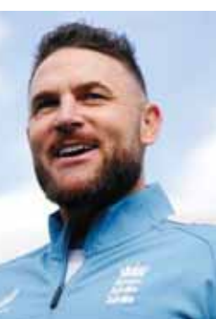
Flower, when England climbed to the top of the world Test rankings after winning the 2010-11 Ashes series in Australia.

Broad said McCullum's approach contrasted with the successful regime under Andy