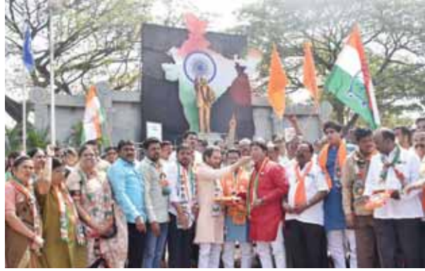
Congress, NCP and Shiv Sena (UBT) workers celebrate their candidates' victory on the Graduates and Teachers constituency seats, in Solapur on Friday

The electoral defeat in the MLC poll from Nagpur Division Teachers' constituency is being seen as a personal setback for Maharashtra's deputy chief minister Devendra Fadnavis and Union Minister Nitin Gadkari, both of whom