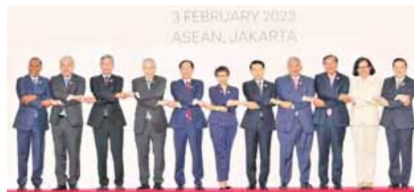
ASEAN Foreign Ministers meeting in Jakarta, Indonesia.

His forced absence is a result of Myanmar's lack of cooperation in implementing a five-step agreement made in 2021 between ASEAN leaders and Myanmar's military leader, Senior Gen. Min Aung Hlaing. In the agreement, Myanmar's military leaders promised to allow a special ASEAN envoy to meet with jailed ousted leader Aung San Suu Kyi and others to foster dialogue aimed at easing the crisis, set off by the military's seizure of power two years ago.