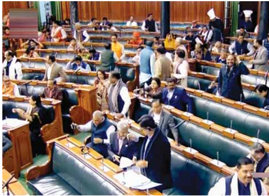
Opposition members in the Lok Sabha during Budget Session of Parliament in New Delhi on Friday

Prior to the ruckus in Parliament, leading to the adjournment of both Houses for the second day, Opposition