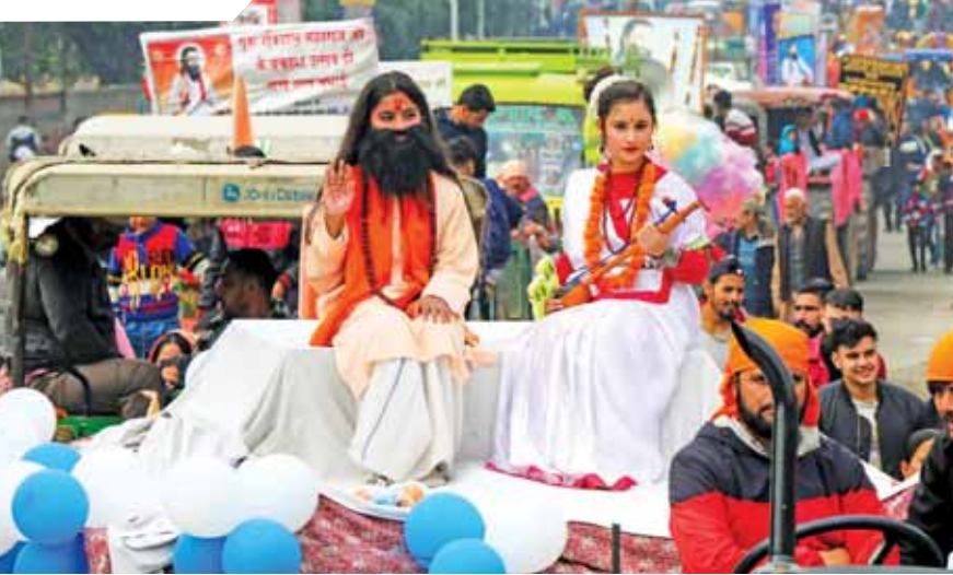
Devotees take part in a religious procession ahead of Ravidas Jayanti, in Jammu