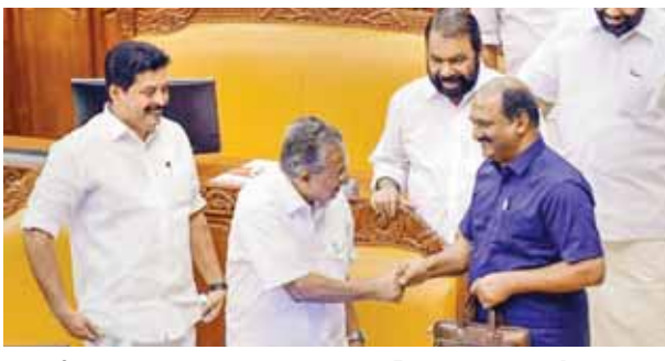
Kerala Chief Minister Pinarayi Vijayan welcomes Finance Minister KN Balagopal as he arrives to present the State Budget 2023-24 in the Assembly, in Thiruvananthapuram on Friday

While presenting the Budget which shows a revenue deficit of ₹24,000 crore, Balagopal blamed the Centre for all ills faced by the State. He said that the BJP-ruled Union Government's measure to restrict the borrowings by the State has upset Kerala's dreams of emerging as the numero uno in the country.