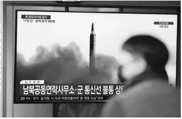
A TV screen is seen reporting North Korea's missile launch with file footage during a news program at the Seoul Railway Station in Seoul, South Korea, on Thursday.

ICBMs all use liquid propellants that must be fuelled before launches. But the fuel in a solid-propellant weapon is already loaded, allowing it to be moved easier and fired faster.