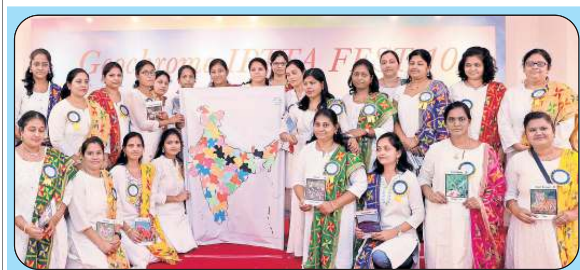
Integrated Preschool Teachers Training Academy (IPTTA), organised a one-day IPTTA-Fest-10, which was inaugurated by Anil Swarup, IAS (Retd.) former secretary, school education, Govt. of India, at the State Gallery of Fine Arts in Madhapur.

Orchids The International School inaugurated the largest Polyhouse facility and a New Auditorium at its Bachupally campus. The horticulture curriculum is titled 'Little Green Fingers', will be taught for students from Grade 1 to 10 and will include both theory and practical classes.