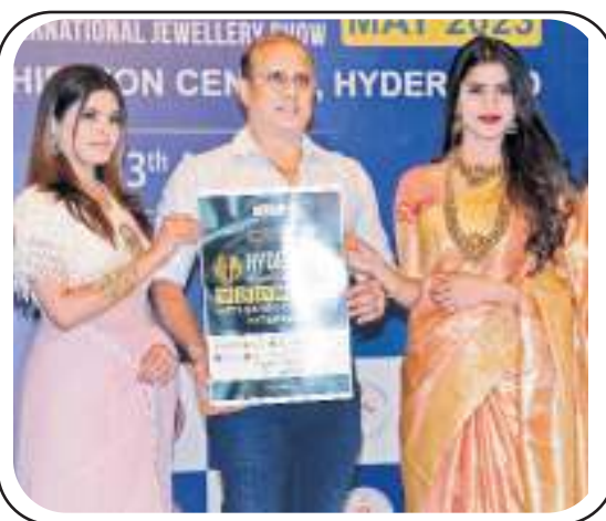
The Hyderabad International Jewellery Show (HIJS) 2023, organised by United exhibitions, will be held at the Hitex exhibition centre in Hyderabad, from May 19 to May 21. HIJS is supported by all major and top jewellery trade bodies from Telangana, Andhra Pradesh, Tamil Nadu, Kerala, and Karnataka.