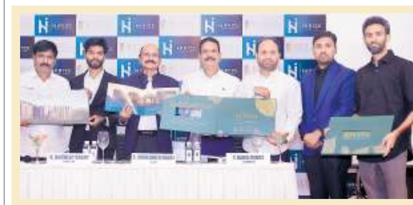
Hirize Developers announced the foray of the group into its latest premium 2,3 BHK gated community project - Hirize Elysia, in the heart of Golden Triangle at Kokapet.