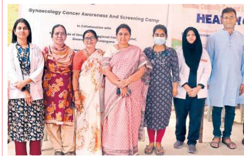
Nirman NGO, along with the support of Cigniti Technologies in collaboration with M.N.J Institute of Oncology and Regional Cancer Hospital, organised a free Gynaecology cancer awareness and screening camp, at Chacha Nehru Nagar community hall in Bansilalpet.