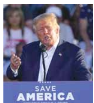
and intensifying criminal investigations, including probes of classified information held at his Mar-a-Lago club and his effort to pressure election officials to overturn the results of the 2020 election. Trump has a history dating back to the 1980s of publicly toying with White House bids only to back down.

Another campaign would be a remarkable turn for any former president, much less one who made history as the first to be impeached twice and remains embroiled in multiple