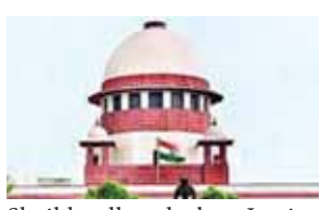
Shaikh alleged that Justice Chandrachud had "on twelve occasions acted in willful disregard and deliberate defiance of binding precedents of larger benches of the Supreme Court and denied justice to deserving litigants."

The matter was listed at 12.45 pm after it was mentioned for urgent hearing before CJJI Lalit. The petition filed by lawyer Mursalin Asijit