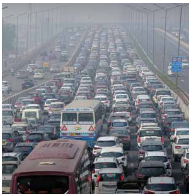
A heavy traffic jam on the NH-24 in New Delhi on Wednesday

Rai asked people to refrain from using coal or firewood for heating purposes and to provide electric heaters to security staff to avoid open burning during winters. "We have to