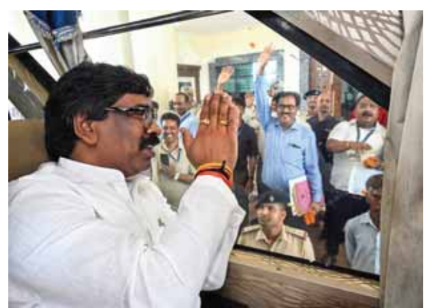
Jharkhand Chief Minister Hemant Soren in Ranchi

"We have also been called on the request of our Opposition. An attempt has been made to show how powerful the ED is. The Opposition is under the misconception that when it cannot face us politically, it can misuse insti-