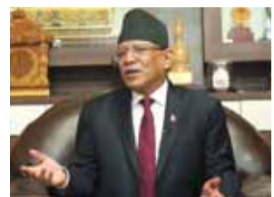
Maoist communist party, a key member of the alliance, said in an interview on Wednesday. Political stability is much needed in the country, where frequent changes in government and squabbles among parties have been blamed for delays in writing the constitution and slow economic development.

No government since the abolition of the centuries-old monarchy in 2008 has completed a full term.