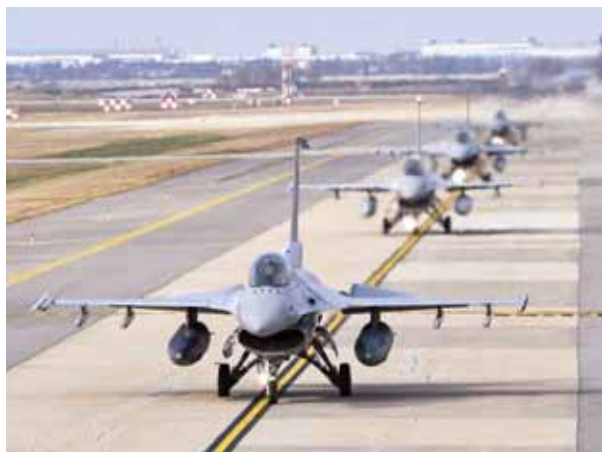
The 23 missiles launched is a record number of daily missile tests by North Korea, some experts say.

South Korea's military said North Korea launched at least 23 missiles — 17 in the morning and six in the afternoon — off its eastern and western coasts on Wednesday. It said the weapons were all short-range ballistic missiles or suspected surface-to-air missiles. Also Wednesday, North Korea fired about 100 artillery shells into an eastern maritime buffer zone the Koreans created in 2018 to reduce tensions, according to South Korea's military.