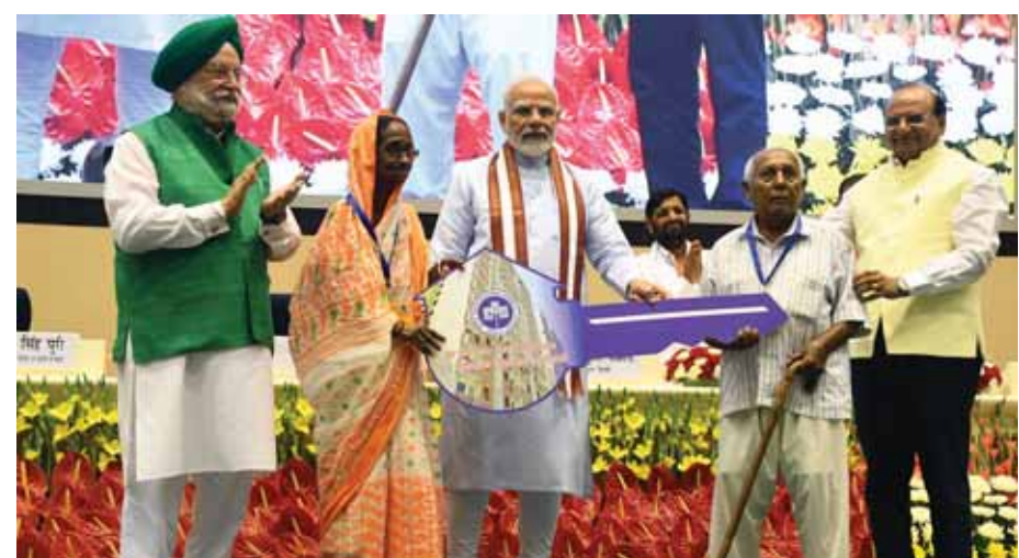
Prime Minister Narendra Modi hands over the symbolic key to a Bhoomiheen Camp slum-dwellers beneficiary during a ceremony at Vigyan Bhawan in New Delhi on Wednesday

"Today is a big day for thousands of slum dwellers. A new beginning to life. As I handed over the keys to eligible beneficiaries, I could see their happy and joyous faces. Over 3,000 houses have been constructed in the first phase of