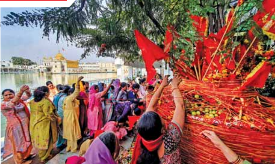
Devotees worship an Amla tree on the occasion of 'Amla Navami', at Durgiana temple in Amritsar