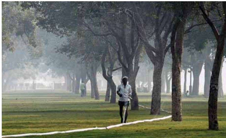
A gardener works at the lawns of India Gate amid low visibility due to a thick layer of smog, at Kartavya Path in New Delhi on Tuesday.

Moderately favourable surface-level wind speed (up to 8 kmph), however, did not allow rapid accumulation of pollutants, meteorology experts said.