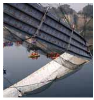
forensic experts believed the main cable of the bridge snapped because of the weight of the new flooring.

The court remanded five other arrested men, including security guards and ticket booking clerks, in judicial custody as police did not seek their