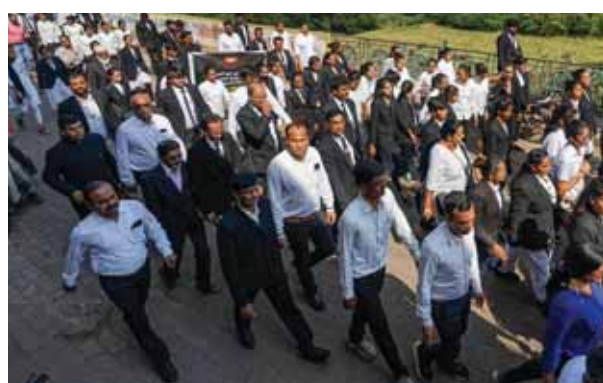
PTI ■ MORBI

Morbi bar protests, says none will defend accused