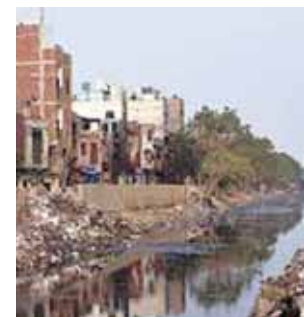
river. Deputy Chief Minister Manish Sisodia held a review

STAFF REPORTER ■ NEW DELHI The Delhi Government on Wednesday said that several measures have been taken to clean the Najafgarh Drain including the installation of a sewage network in unauthorised colonies, construction of Sewage Treatment Plants (STPs), De-centralized-STPs etc, as it directly falls into the Yamuna river. They said that this was very crucial to clean the drain in order to clean the