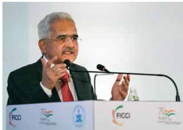
Reserve Bank of India (RBI) Governor Shaktikanta Das addresses during the annual banking conference organised by Federation of Indian Chambers of Commerce & Industry (FICCI), in Mumbai on Wednesday

During the pandemic, the RBI utilised flexibility in the monetary policy framework to tolerate a slightly higher inflation which was within the target range of 2-6 per cent, to ensure that overall economy