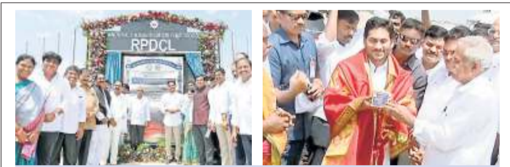
At Ramayapatnam Port, Rs 3,740 crore would be spent for constructing four berths with a handling capacity of 25 million tonnes, where six additional berths could be added in the future with Rs 200 crore for each for handling over 50 million tonnes.

He said that at Ramayapatnam Port, Rs 3,740 crore would be spent for constructing four berths with a handling capacity of 25 million tonnes, where six additional