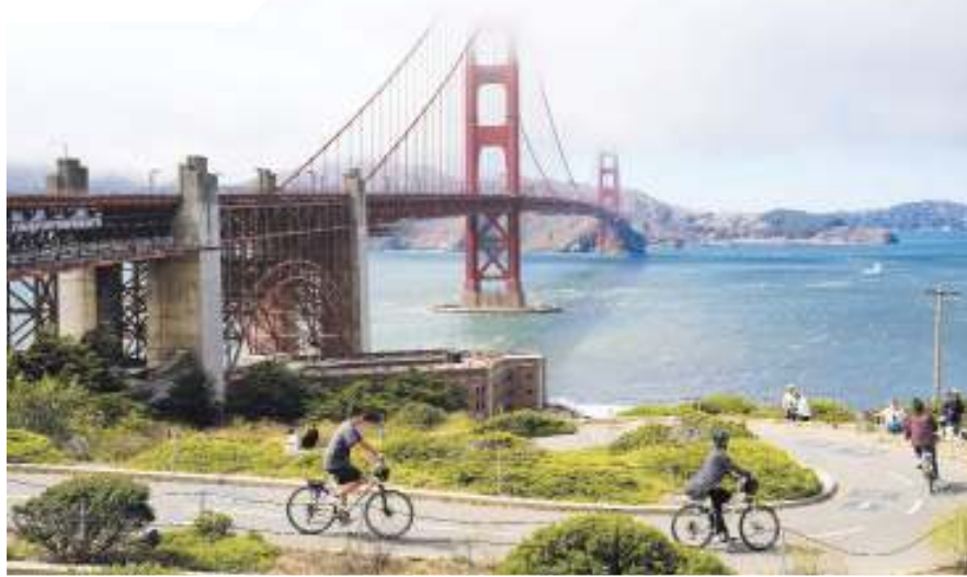
People visit the Golden Gate Bridge in San Francisco