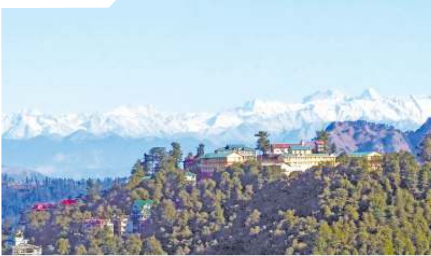
Snow-covered Himalayas mountain range after fresh snowfall, seen from Shimla