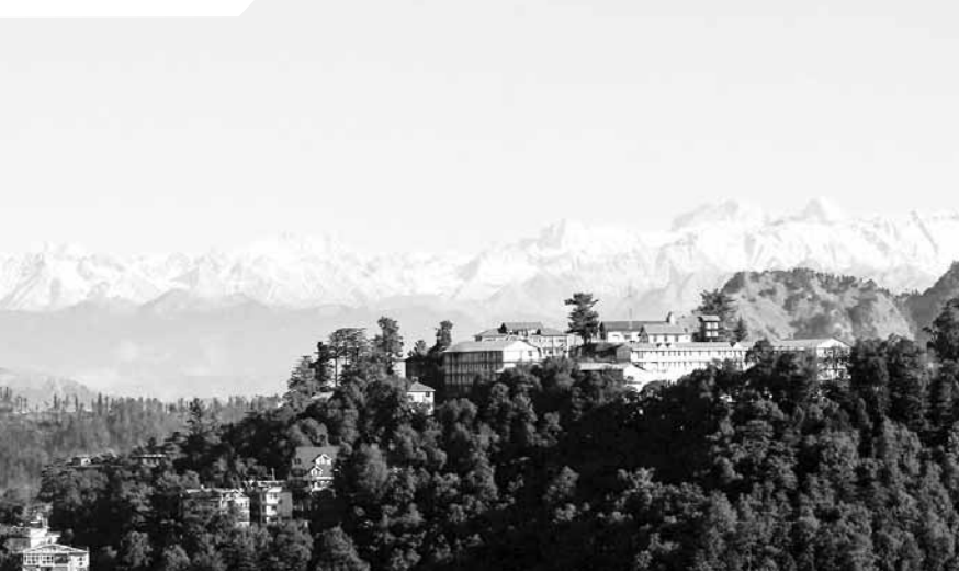
Snow-covered Himalayas mountain range after fresh snowfall, seen from Shimla