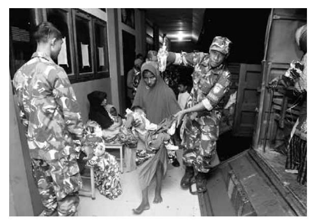
Indonesian soldiers help ethnic Rohingya women and children to step out of a military truck upon arrival at a temporary shelter after their boat landed in Pidie, Aceh province, Indonesia on Monday.

from residents, health workers and others. Fauzi said that immigration officials and police were trying to identify the refugee to determine if they were from the group of 190 Rohingya who were reported by United Nations to be drifting in a small boat in the Andaman Sea for a month. The UNHCR on Friday urged countries to rescue the refugees, saying reports indicated they were in dire condition with insufficient food or water. "Many are women and children, with reports of up to 20 people dying on the unseaworthy vessel during the journey," the agency said. Also on Friday, another group of 58 Rohingya — all