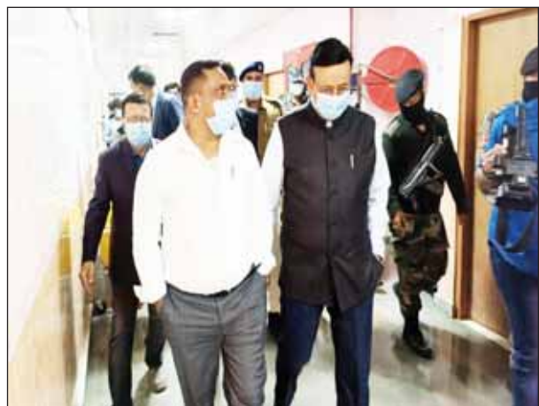
Health Minister Banna Gupta participates in the national level mock drill for the prevention and preparation of new variant BF.7 of Corona virus (COVID-19), at Sadar Hospital in Ranchi on Tuesday.

PNS : RANCHI corona patient reaches the door of Covid Hospital at Sadar Hospital. As soon as the ambulance reaches the hospital premises, the medical staff wearing PPE kits takes the patient on a