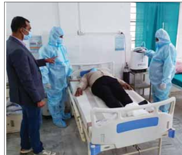
Medic during a national level mock drill for the prevention and preparation of new variant BF.7 of Corona virus (COVID-19), at RIMS in Ranchi on Tuesday.

The facts derived from the mock drill at RIMS are