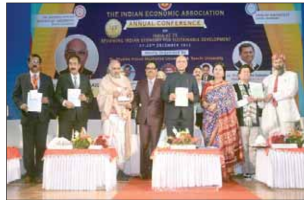
Governor Ramesh Bais alongwith others during the Indian Economic Association Annual Conference, in Ranchi on Tuesday.