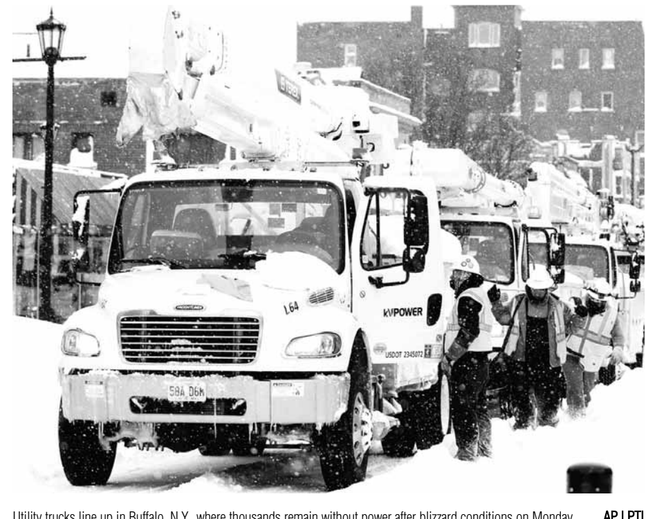
Utility trucks line up in Buffalo, N.Y., where thousands remain without power after blizzard conditions on Monday.