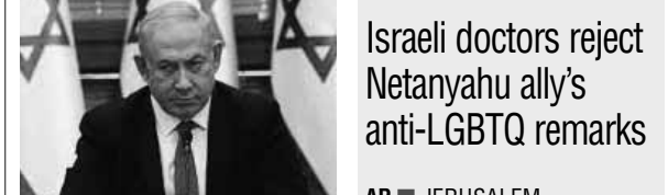
Israeli doctors reject Netanyahu ally's anti-LGBTQ remarks. AP ■ JERUSALEM

Over 1,000 senior Israeli air force veterans, including a former Israeli chief of staff, on Monday urged the country's top legal officials to stand tough against the incoming government. In a letter to the chief of Israel's Supreme Court and other top officials, they said the alliance of religious and ultranationalist parties threatens Israel's future. The letter was delivered days before the new government is to take office. "We come from all strata of society and from across the political spectrum. What we have in common today is the fear that the democratic state of Israel is in danger," the letter said. It called the legal officials "the final line of defence" and "implored them to 'do' everything in your reach to stop the disaster that is affecting our country." Among the nearly 1,200 signatories were Dan Halutz, who served as military chief from 2005-2007; Avihu Ben-