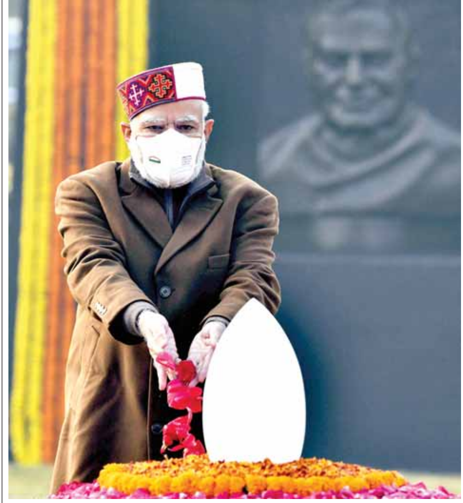
Prime Minister Narendra Modi pays tribute to former Prime Minister Atal Bihari Vajpayee on his birth anniversary, at Sadav Atal, in New Delhi on Sunday.

What action do we have to take we have to start today. Actually, we had to act five years ago but we did not do it. If we don't act fast, then there will be a big loss. I am extremely concerned with what is happening at the border in Arunachal and Ladakh," he added.