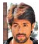
Actor — Yash

It's not a good development when people start ridiculing Bollywood saying, 'They are nothing'. It's just a phase. They have taught us so many things.