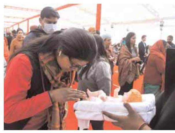
People offer prayers during Christmas celebrations at Sacred Heart Cathedral Catholic Church, in New Delhi, on Sunday

"However, we urged people to wear masks and maintain social distance considering