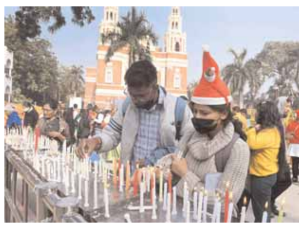
People light up the candles on birthday of Jesus Christ at Sacred Heart Cathedral Catholic Church, in New Delhi, on Sunday

cases are rising in some countries," he said. An administration official at the Roman Catholic Archdiocese of Delhi said though people turned out in big numbers this time, most of them observed Covid-appropriate behaviour. The pandemic had put a halt to big congregations with most churches hosting socially distanced celebrations for two years. In 2020, churches in Delhi held multiple masses on December 24-25, where a limited number of people were admitted through online registration to ensure social distancing. Though there were no restrictions on the number of visitors last year, fewer people reached churches amid concern over the Omicron variant of the coronavirus.