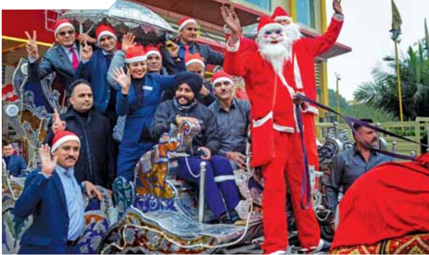
Men dressed as Santa Claus ride on a horsecart during Christmas celebrations, in Amritsar