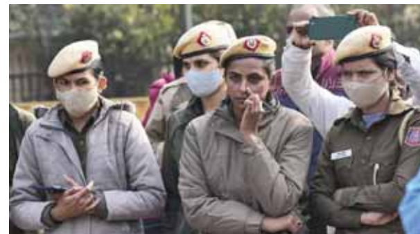
Delhi Police personnel featured in posters of various awareness campaigns