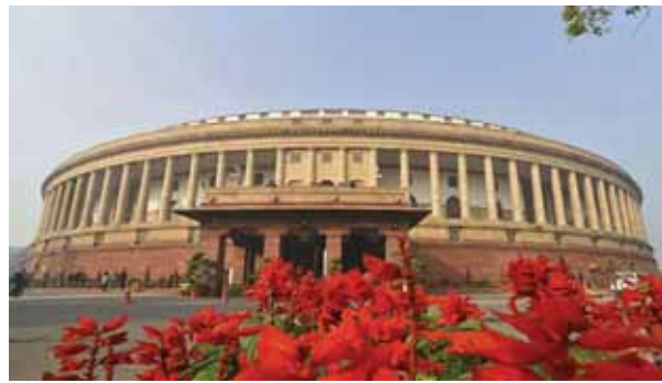
Allowances and Pensions of Members of Parliament Act, 1954.

The Ministry of Fisheries, Animal Husbandry and Dairying informed the committee that the parliamentarians elected or nominated to the AWBI did not receive any honorarium or grants, but were entitled to daily allowances for attending meetings of the board in accordance with the Salary,