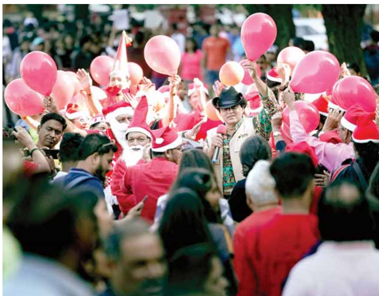
People celebrate Christmas at Marine Drive in Mumbai on Sunday

The mercury dropped to 3 degrees Celsius in the Ridge area, 4.9 degrees Celsius below normal, making it the coldest place in the Capital.