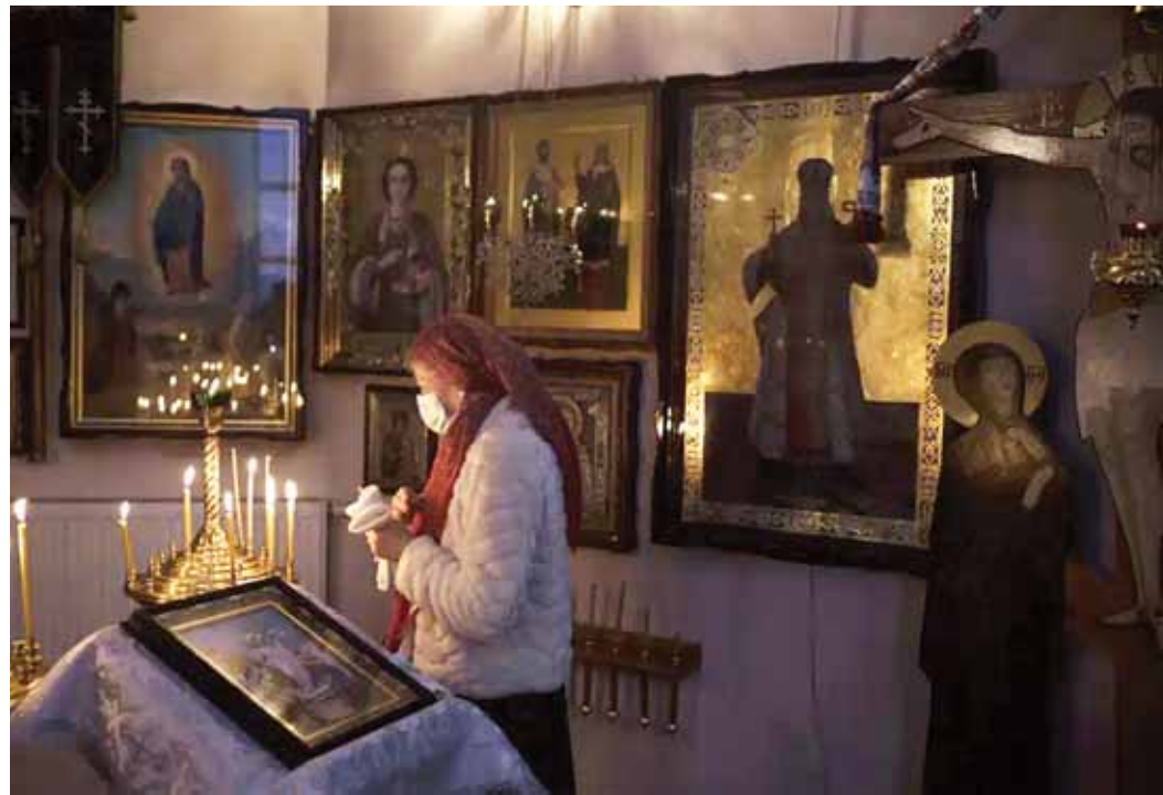
The Synod of the Orthodox Church of Ukraine decreed in October that local church rectors could choose the date along with their communities, saying the decision followed years of discussion but also resulted from the circumstances of the war.

The Catholic Church first adopted the modern, more astronomically precise