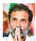
Congress leader — Rahul Gandhi

They spread hatred, we spread love and embrace all Indians. There is Hindustan and 'Mohabbat' (love) in this Bharat Jodo yatra, which does not see any caste, creed, religion, rich or poor and all embrace each other.