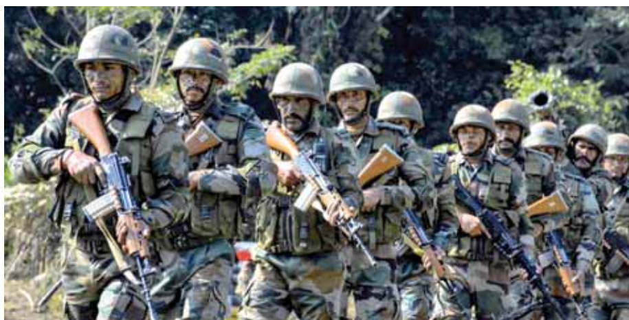
ceasefire in 2021. Jammu shares a 192 km-long front of the total 2,289 km India -Pakistan

The first phase of the infrastructure renovation and creation of some new ones has been recently completed on a stretch of 26 km along the frontier in Jammu and works on another 33 km in the same region is underway. The move comes a year after the two countries announced a military