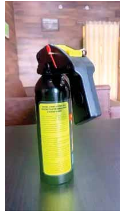
Capsaicin-based sprays are globally accepted for self defence against animal attacks. They have been tried and tested for decades around the world on a variety of animals. In fact, the capsaicin-based aerosol spray has been recommended by

Development of red pepper spray-based repellents for bear defence has been advocated in many settings.