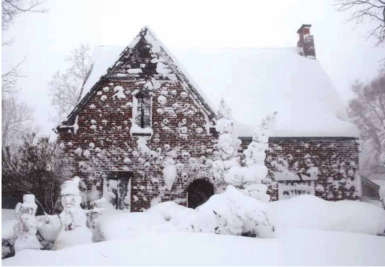
Christmas morning. The Tennessee Valley Authority, which provides electricity to 10 million people in the state and parts of six surrounding ones, directed local power companies to implement planned interruptions but ended the measure by Saturday afternoon. The start of the NFL's Tennessee Titans' game in Nashville was delayed an hour by a planned power outage.

Pennsylvania-based PJM Interconnection said power plants are having difficulty operating in the frigid weather and has asked residents in 13 states to conserve electricity through at least