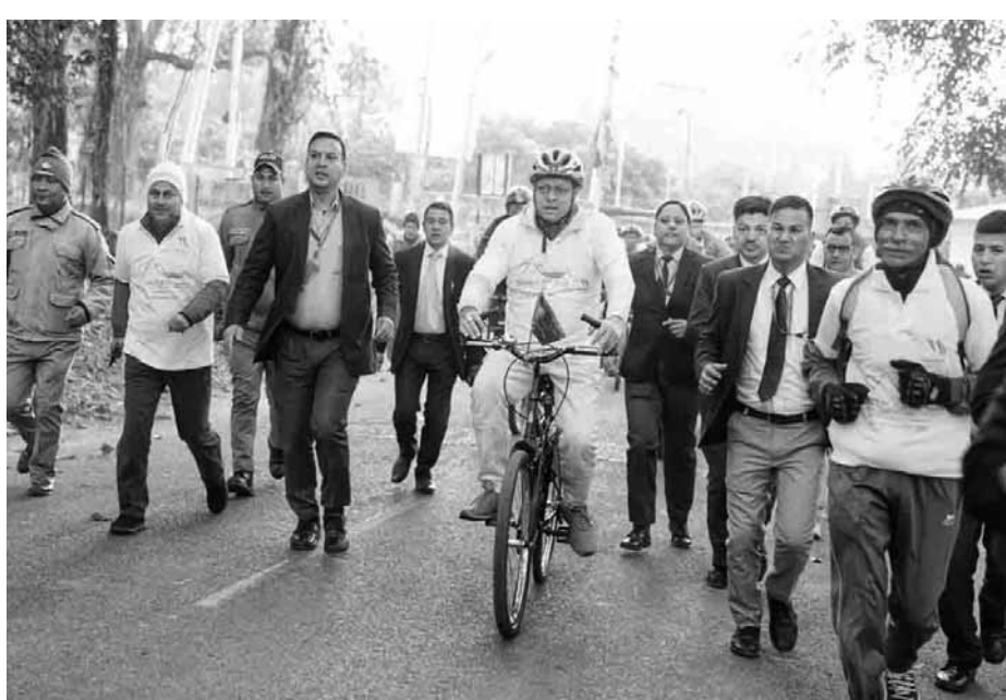
CM Pushkar Singh Dhahi pedals after flagging off a cycle rally from Dehradun as part of the Mussoorie winter carnival on Tuesday.