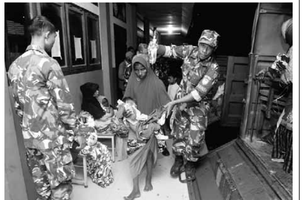
Indonesian soldiers help ethnic Rohingya women and children to step out of a military truck upon arrival at a temporary shelter after their boat landed in Pidie, Aceh province, Indonesia on Monday.

from residents, health workers and others. Fauzi said that immigration officials and police were trying to identify the refugee to determine if they were from the group of 190 Rohingya who were reported by United Nations to be drifting in a small boat in the Andaman Sea for a month. The UNHCR on Friday urged countries to rescue the refugees, saying reports indicated they were in dire condition with insufficient food or water. "Many are women and children, with reports of up to 20 people dying on the unseaworthy vessel during the journey," the agency said. Also on Friday, another group of 58 Rohingya — all