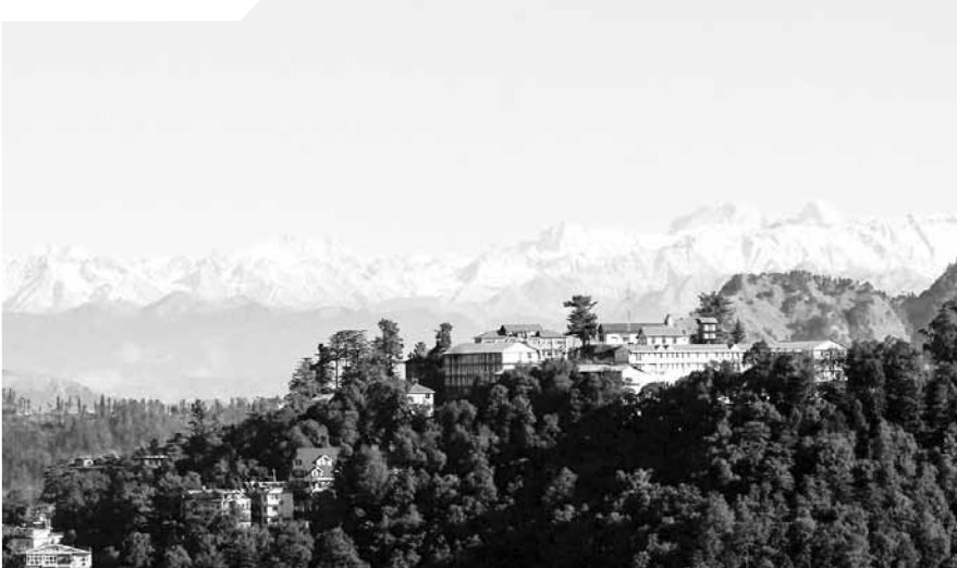
Snow-covered Himalayas mountain range after fresh snowfall, seen from Shimla