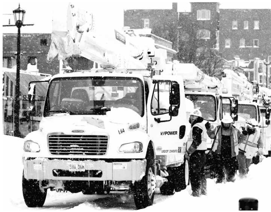
Utility trucks line up in Buffalo, N.Y., where thousands remain without power after blizzard conditions on Monday.