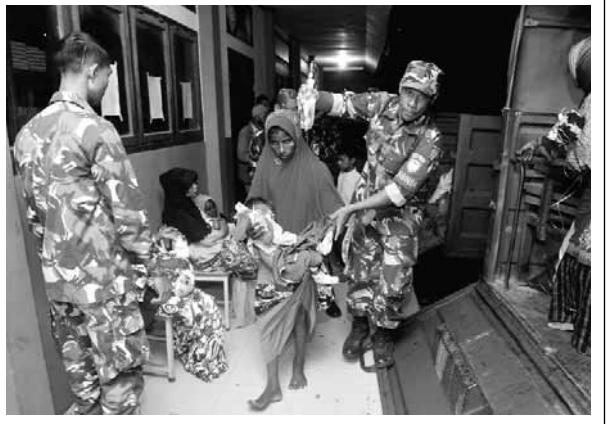
Indonesian soldiers help ethnic Rohingya women and children to step out of a military truck upon arrival at a temporary shelter after their boat landed in Pidie, Aceh province, Indonesia on Monday.

from residents, health workers and others. Fauzi said that immigration officials and police were trying to identify the refugee to determine if they were from the group of 190 Rohingya who were reported by United Nations to be drifting in a small boat in the Andaman Sea for a month. The UNHCR on Friday urged countries to rescue the refugees, saying reports indicated they were in dire condition with insufficient food or water. "Many are women and children, with reports of up to 20 people dying on the unseaworthy vessel during the journey," the agency said. Also on Friday, another group of 58 Rohingya — all