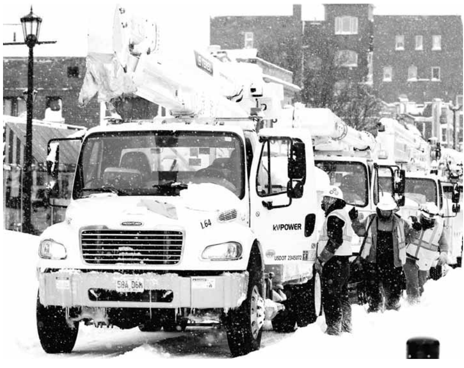
Utility trucks line up in Buffalo, N.Y., where thousands remain without power after blizzard conditions on Monday.