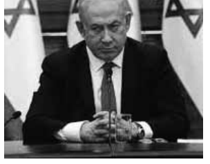
AP ■ JERUSALEM

Israeli doctors reject Netanyahu ally's anti-LGBTQ remarks AP ■ JERUSALEM Israel's largest medical centre and healthcare workers from hospitals around the country have spoken out against remarks by allies of Benjamin Netanyahu calling for a law to allow discrimination against LGBTQ people in hospitals and businesses. It was part of a broader backlash against remarks made this week by Religious Zionism politicians calling for legal discrimination against LGBTQ people. Netanyahu's new government — the most religious and hard-line in Israel's history — is made up of ultra-Orthodox parties, an ultranationalist religious faction, and his Likud party. It is to be sworn in on Thursday. Nun, a former commander of the air force and Amos Yadlin, a former head of military intelligence. All three are former fighter pilots. Former Prime Minister Benjamin Netanyahu and his ultra-Orthodox and far-right partners captured a parliamentary majority in Nov. 1 elections.