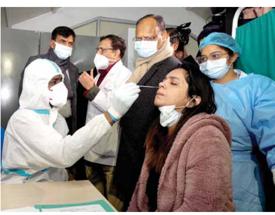
Union Health Minister Mansukh Mandaviya speaks with a doctor as a medic collects swab sample of a woman, during a nationwide mock drill for Covid-19 preparedness, at Safdarjung hospital in New Delhi on Tuesday

with any increase in the number of coronavirus cases. "I reviewed the Covid response mock drill at Safdarjung Hospital. This mock drill was necessary to know how prepared our hospitals are," the minister said. "Covid cases are rising all over the world and India might witness a spike in cases too. Hence it is important that the entire Covid infrastructure in terms of equipment, processes and human resources are at a state of operational readiness," he stated. Meanwhile, representatives of the Indian Medical Association (IMA) and other top doctors and public health experts on Tuesday urged the Minister to allow people to take their second coronavirus booster doses. The meeting, over a video conference, was called to discuss the preparedness for any possible surges in the outbreak.