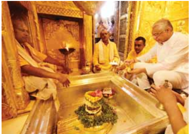
Mauritius PM Pravind Jugnauth performing puja at Shri Kashi Vishwanath Mandir.

It is learnt that the Mauritius PM reached Varanasi in the evening on Wednesday last on a three-day stay along with a 17-member team. He was accorded a warm welcome at Lal Bahadur