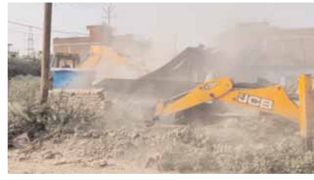
Illegal construction being demolished by KDA enforcement squad.