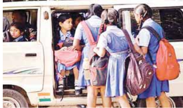
Vans dangerously laden with school children pose a big risk to their safety.