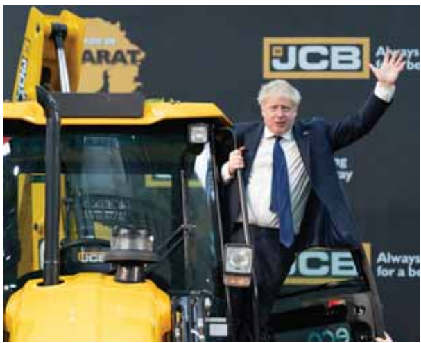
Britain's Prime Minister Boris Johnson climbs onto a JCB at the new JCB Factory in Vadodara on Thursday

India's ties with Russia in the backdrop of the ongoing conflict in Ukraine sanctions will be discussed in the summit