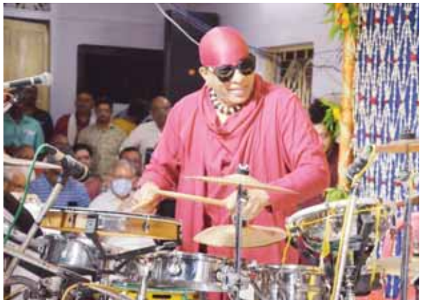
Drummer Sivamani performing in Sankat Mochan Sangeet Samaroh.