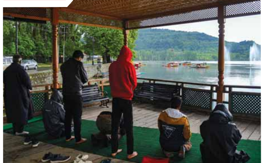
Boatmen offer 'zohar' prayers on the 19th day of Ramzan at a jetty on Dal Lake, in Srinagar