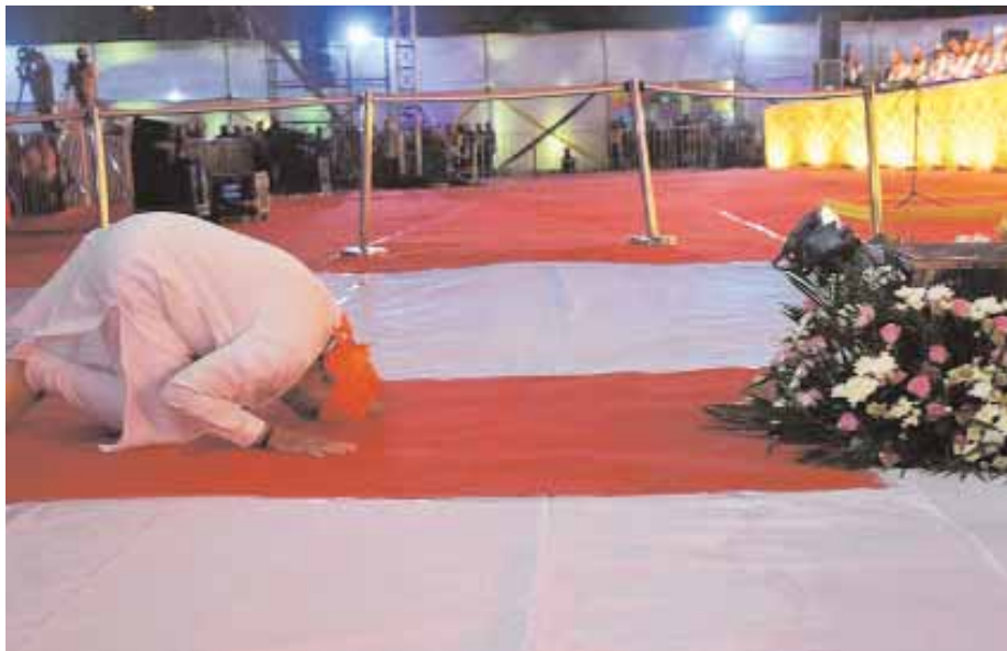
Prime Minister Narendra Modi pays obeisance during the 400th Parkash Purab celebrations of Guru Tegh Bahadur at Red Fort in Delhi on Thursday

The Prime Minister later released a postal stamp and a commemorative coin on the Sikh guru.