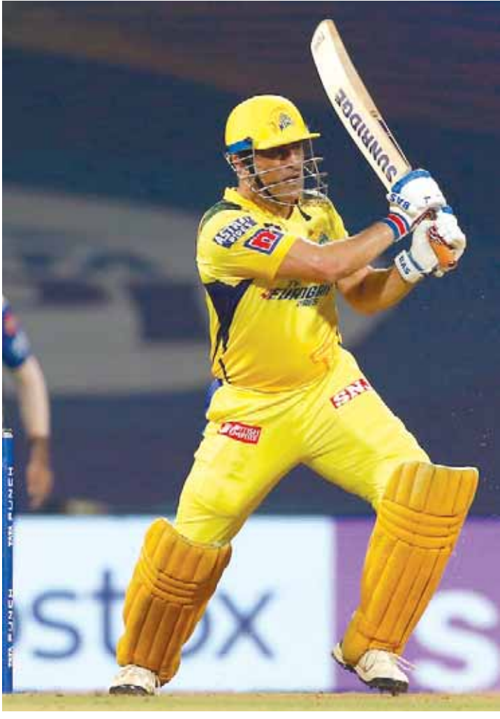
While Rohit offered an easy catch to Mitchell Santner at mid-on, Kishan was undone by a swinging yorker, which rattled his off-stump. Brevis (4) became Choudhary's third victim. Brevis tried to chase a delivery outside the off stump, but ended up nicking to Dhoni. Suryakumar Yadav (32) started with a boundary, an on drive. He creamed another drive off Choudhary and then launched into mystery spin-

However, Varma's unbeaten 51 off 43 balls, in which he struck three fours and two sixes, along with Unadkat's blazing unbeaten 19, helped Mumbai cross the 150 run-mark.