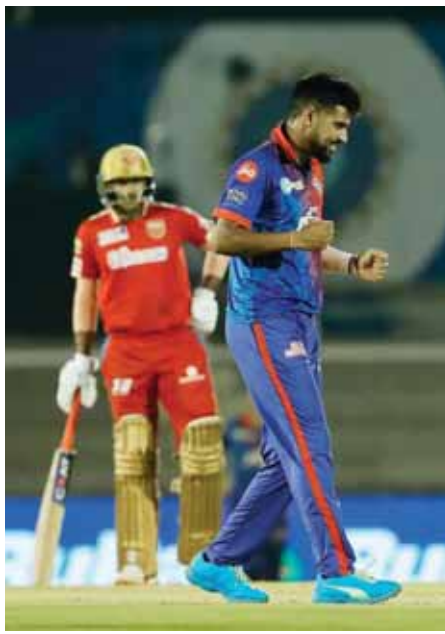
Having lost to RCB the other night, a comprehensive win was necessary to get the campaign back on track and that is precisely what happened against PBKS.

Speaking about the next match, the all-rounder said, "They (RR) have been one of the most consistent teams in the tournament so far, and have been playing quality cricket. However, we will focus on ourselves, we will go with our plans and try to execute them."