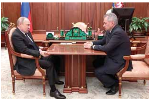
Russian President Vladimir Putin with Defence Minister Sergei Shoigu during their meeting in the Kremlin in Moscow on Thursday