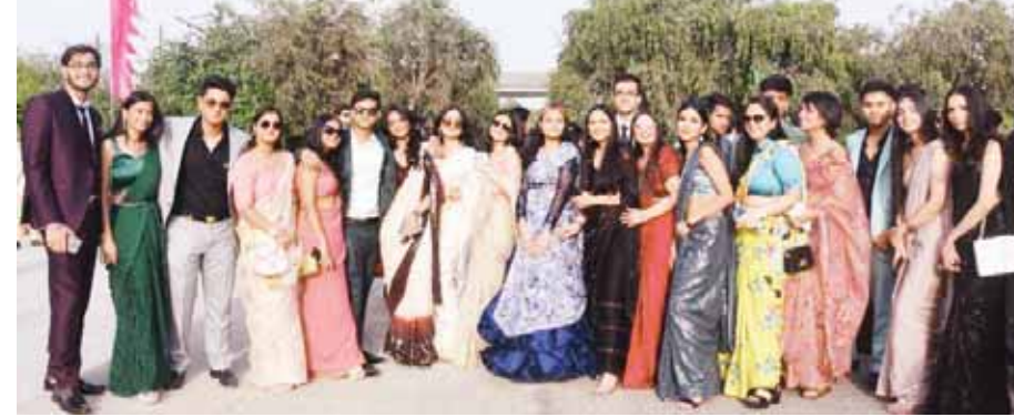
Farewell function was held at DPS Azaad Nagar on Thursday.

Principal, Delhi Public School (DPS), Azaad Nagar, while addressing the farewell function of the school titled 'Udaan' on Thursday said students of the school had spent a substantial number of years and the school had nurtured them in every way to not only make them excel in academics but also to bring out their latent talents. She appealed to students to act as brand ambassadors for their school and ensure that with hard work and devotion they succeed in their goals of life.