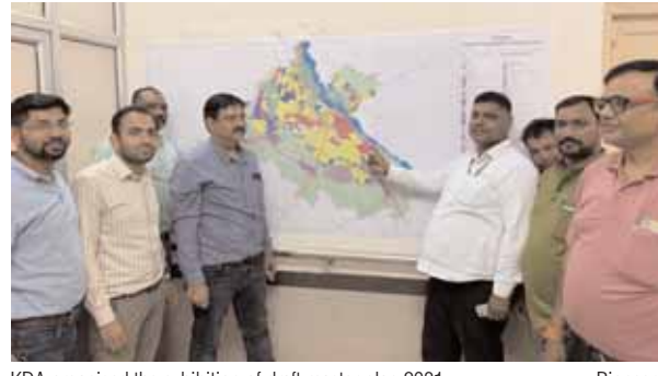
KDA organised the exhibition of draft master plan 2031.

In order to get Master Plan 2031 approved, Kanpur Development Authority (KDA) has organised its exhibition at five places. It aimed at making people understand the concept of Master Plan 2031 and submit their objections, if any. General people, government and semi-government departments, stakeholders and different organisations were asked to submit their suggestions and objections by May 19. On the basis of the approved Master Plan, further developmental works will be carried out.