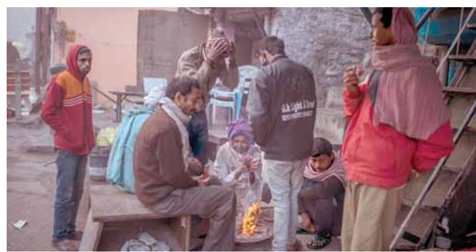
People warm themselves around a bonfire on a cold morning in New Delhi on Tuesday.

FORDA, in a statement issued late evening, said, "Since the voices of thousands of resident doctors are not being heard by the authorities, we have returned the 'taalis and thaalis' that were clamoured, and 'phool' (flowers) which were showered upon us during the previous waves of Covid-19 pandemic".