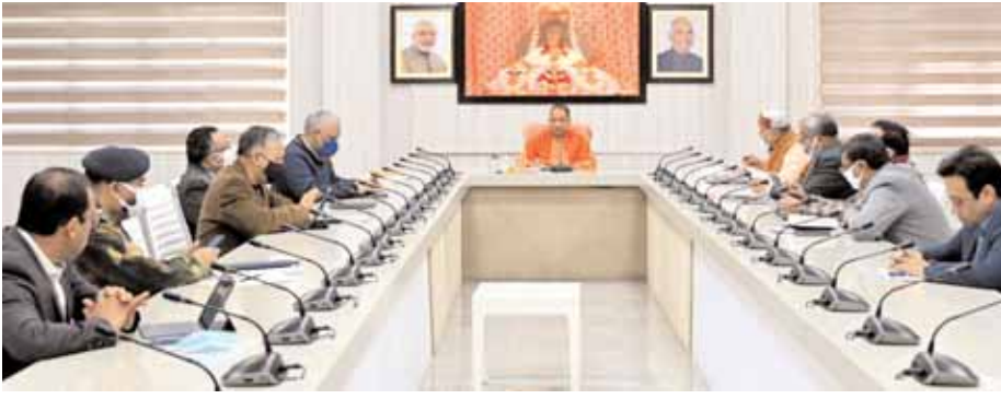
Chief Minister Yogi Adityanath during a Covid review meeting in Lucknow on Tuesday