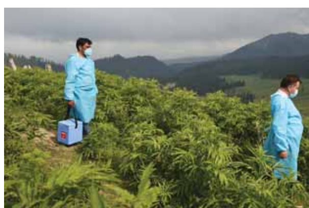
Health workers during door to door Covid-19 inoculation drive at Tosamaidan in Budgam district on Monday.

Out of 200 Omicron cases, 77 patients have recovered or migrated. Maharashtra and Delhi have the highest number of Omicron cases, at 54 each,