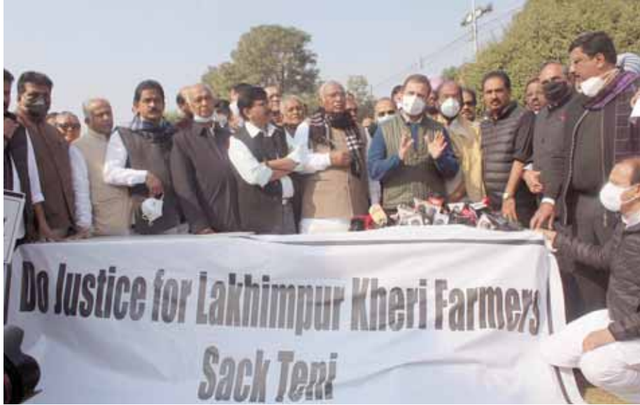
Congress leader Rahul Gandhi, along with other Opposition leaders, addresses the media after a protest march from Gandhi statue on Parliament premises to Vijay Chowk in New Delhi on Tuesday.

Mounting more pressure on the Modi Government, the Opposition leaders on Tuesday took out a protest march demanding that action be taken against Union Minister Ajay Mishra in the Lakhimpur Kheri violence case. Leaders of several Opposition parties took out the march from Gandhi statue inside Parliament complex to Vijay Chowk demanding that the minister, whose son has been arrested in the Lakhimpur violence case, be immediately sacked. Congress leader Rahul Gandhi said they will not rest till the Minister is sent to jail. They also demanded that the suspension of their 12 MPs in Rajya Sabha be immediately revoked.