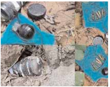
A police officer said they are yet to confirm whether any militant outfit or any other inimical group planted the IEDs or planned any attack.

Shillong: Two powerful Improvised Explosive Devices (IEDs), weighing over 11 kg, a live grenade and other live ammunitions were recovered during separate anti-insurgency operations in Meghalaya, officials said on Tuesday. Police said that the two IEDs were found in a bag placed under a culvert at Rechange village in West Garo Hills district late on Monday night. Later, the security personnel defused them. One of the IEDs, weighing about 10 kg, was stored in a pressure cooker while another was assembled in a tin box. In another incident, one live grenade and six 7.62 mm bullets were recovered by the Meghalaya police at Du'magitok village in the same West Garo Hills district on Tuesday night. The police registered separate cases and launched a probe.