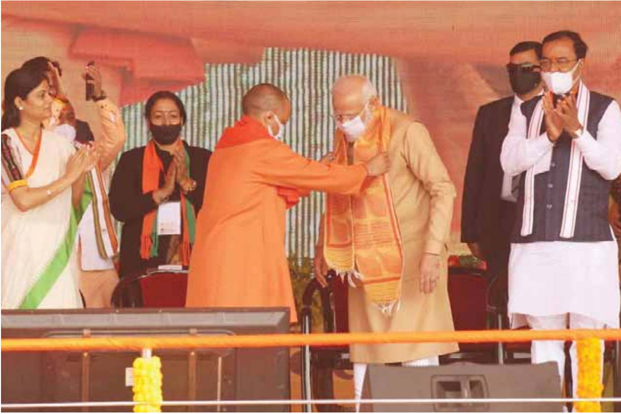
Chief Minister Yogi Adityanath honouring Prime Minister by offering him angvastram during a programme held at Parade Ground in Sangam.