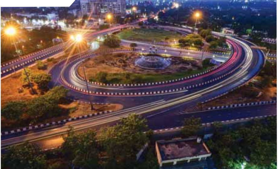
Light trails of passing vehicles at the AIIMS flyover, in New Delhi