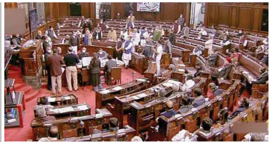
Rajya Sabha Deputy Chairman Harivansh Narayan Singh conducts proceedings in the House during the Winter Session of Parliament, in New Delhi, on Tuesday.

States and union territories have been asked to undertake several activities which include strict monitoring of international travellers in the community, contact tracing of positive individuals and follow up for 14 days, genome sequencing of positive samples through INSACOG Labs in a prompt manner, Mandaviya said.