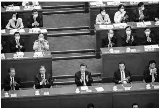
Chinese President Xi Jinping, centre, applauds after the passage of a piece of national security legislation concerning Hong Kong during the closing session of China's National People's Congress (NPC) in Beijing on Thursday.

Critics fear it could lead to Hong Kongers being prosecuted for criticising their or the