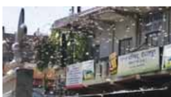
This grab made from Wednesday video provided by KK Productions shows locusts swarming over city and nearby area in Indore.

It is estimated that crops on 10-15 lakh acres have been affected across six States since December last year while the Government estimates around one lakh acres of cotton, summer pulses and vegetables crops have been affected so far. The Ministry of Agriculture esti-