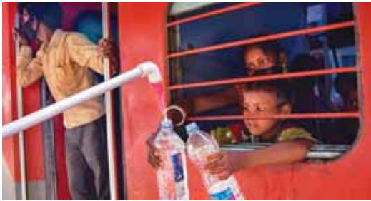
Cadets of Scouts & Guides provide drinking water to the migrants sitting in a Shramik Special train for their native places, during ongoing Covid-19 lockdown at Mathura Railway Station on Thursday.

The SC, which passed interim directions, said all migrant workers who are stranded shall be provided food by concerned States and Union Territories (UTs) at places which shall be publicised and notified to them for the period they are waiting for their turn to board a train or a bus. A Bench headed by Justice