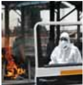
The driver of an ambulance returns after helping cremate the body of a woman who died of Covid-19 in New Delhi on Thursday.

West Bengal, which is battling with coronavirus and destruction caused by Amphan cyclone, reported 344 new coronavirus cases which is the highest single-day spike in