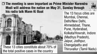
The meeting is seen important as Prime Minister Narendra Modi will address the nation on May 31, Sunday through his radio talk Mann Ki Baat