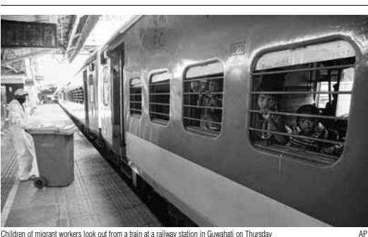
Children of migrant workers look out from a train at a railway station in Guwahati on Thursday

"Hundred vaccines are being tested, instead of one. Simultaneously, we have to go fast on the regulatory process without compromising quality. We have to have manufacturing capability without compromising our standard immunising programme."