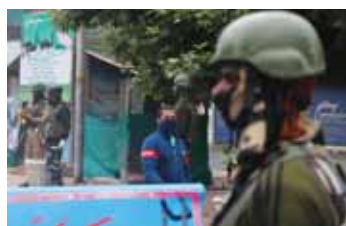
Paramilitary soldiers stand guard near a checkpoint in Srinagar on Thursday.

According to official sources, the explosive-laden car, bearing a fake registration number JK08B-1426, was detonated by the Bomb Disposal Squad causing extensive damage to window panes of local