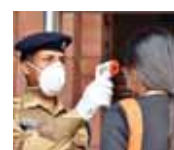
In this file photo, an Indian Army truck crosses Chang La pass near Pangong Lake in Ladakh region.

The Centre on Thursday issued a new set of guidelines which says centralised ACs may not be used for time