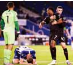
Raheem Sterling scores a hat trick as Manchester City beat Brighton 5-0

Sterling made the breakthrough, expertly