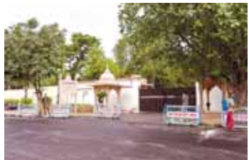
A worker sanitises barricades as security personnel stand guard outside the official residence of Rajasthan Chief Minister Ashok Gehlot in Jaipur on Sunday.