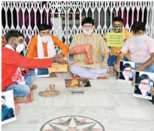
Fans of Bollywood mega star Amitabh Bachchan and his son Abhishek Bachchan perform 'Hawa' for their speedy recovery from COVID-19, outside a temple in Ranchi on Sunday