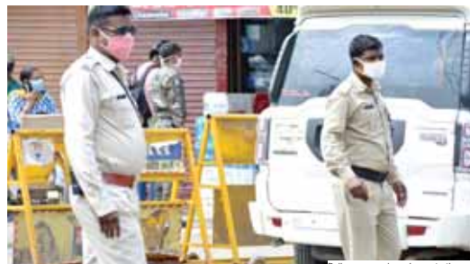
Police personnel wearing protective mask on duty, amid the Covid-19 Unlock 2.0, in Ranchi on Sunday

The Ranchi police has extra precaution on safety of cops is in wake up to several police stations in State Capital witnessing Covid 19 cases. In past few weeks there has been