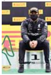
Lewis Hamilton celebrates with Styrian Grand Prix trophy after win

"It's great to be back up here and thanks to the team," said Hamilton. "This feels like it has