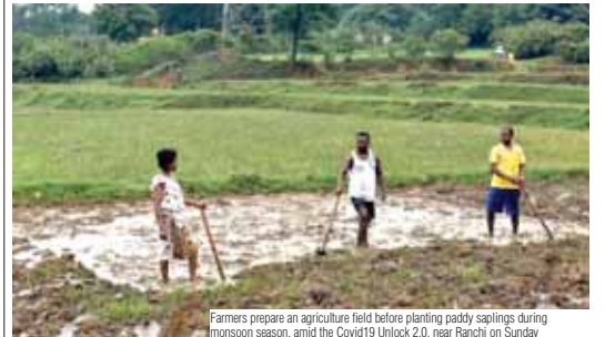
Farmers prepare an agriculture field before planting paddy saplings during monsoon season, amid the Covid19 Unlock 2.0, near Ranchi on Sunday