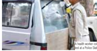
A health worker collects sample from a policeman for Covid-19 test at a Police Station in Ranchi on Sunday.

The order for another batch of nearly 74,000 rifles will be placed as per the special financial powers granted to the armed forces for such emergency purchases, they said.