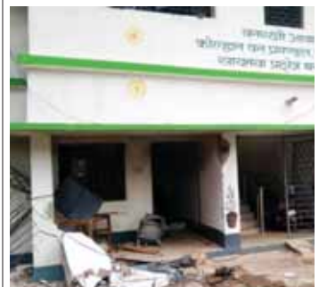
A supplied photo of a forest department building which was blown up by CPI (Maoist) rebels in West Singhbhum on Sunday