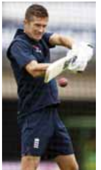
Former England captain Michael Vaughan feels the out of form Joe Denly should be the one making way for skipper Joe Root in the second Test against the West Indies instead of young Zak Crawley.

On the other hand, 22-year-old Crawley scored his second half-century in five Tests with a superb 76-run knock in the sec-