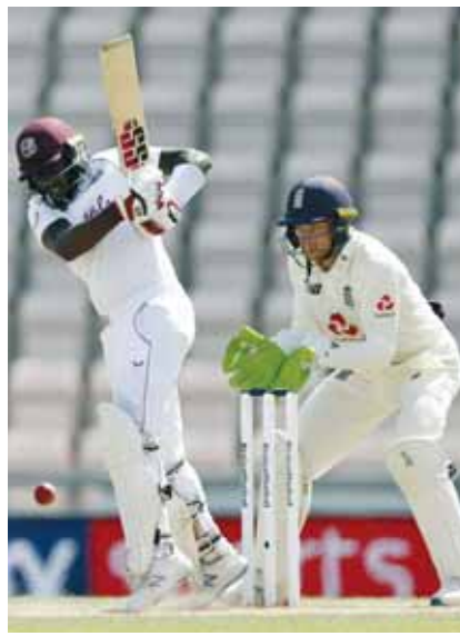
West Indies' Jermaine Blackwood plays a shot during his 95-run innings on fifth day of 1st Test

Hope played two cover drives for four to ease the early pressure but Wood