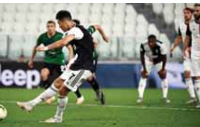
Cristiano Ronaldo scores a penalty to level the match

It was an ultimately frustrating outing for Atalanta who stay third, nine points off the pace, after conceding both spot-kicks for handball. "What are we meant to do, cut our arms off? You can at most put your arms