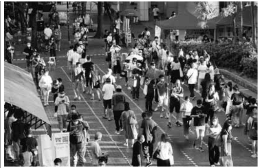
People queue up to vote in an unofficial primary for pro-democracy candidates ahead of legislative elections in September, in Hong Kong on Sunday.