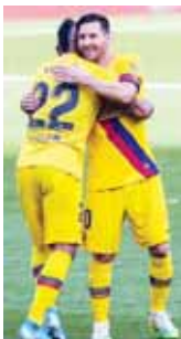
Lionel Messi celebrates with Real Valladolid's defender

Yet even as Barca's turbulent domestic campaign draws to a close, Messi continues to shine.