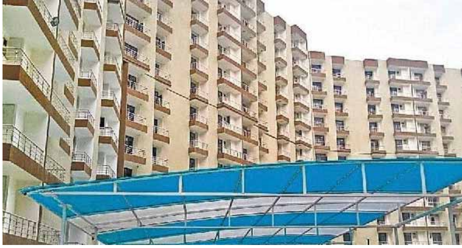
KDA Signature Greens City Apartments ready for possession of flats to buyers

Till the installation of a 33 KV power transformer, alternative arrangements to provide electricity to residents have been made. The work for