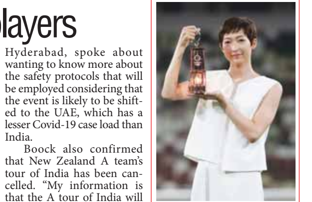
Japanese swimmer Ikee Rikako holding the lantern containing Olympic flame poses during a photo session at the Olympic Stadium in Tokyo

Bahrain, which had topped the 4x400 mixed relay final, was disqualified after Kemi Adekoya was handed a four-year ban by the Athletics Integrity Unit (AIU) for failing