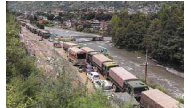
Army vehicles move towards Leh along the Manali-Leh highway amid the ongoing India-China border dispute, in Kullu district