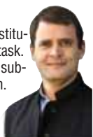
Congress leader —Rahul Gandhi

PM Modi is 100 per cent focussed on building his image. India's captured institutions are busy doing this task. One man's image is not a substitute for a national vision.