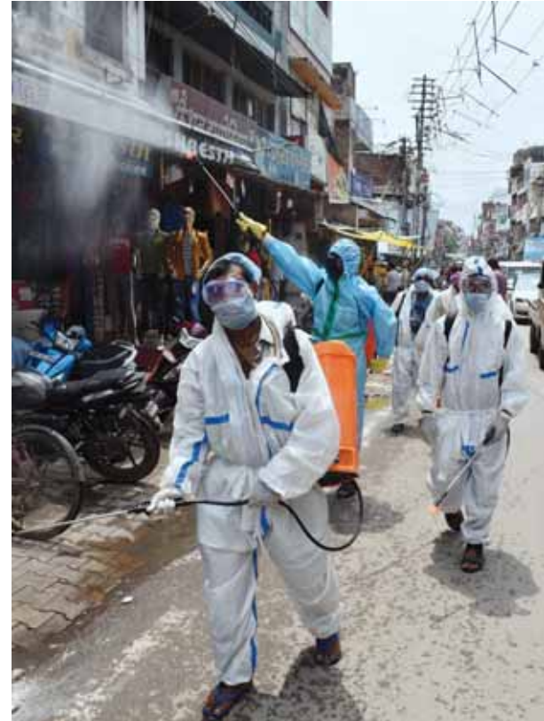
not yet received here.

Food and 'kaadha' are being given to the patients, medicines which reduce the risk of viruses and increase immunity have not been sent from the department yet. Patients are asking doctors the same question if they will be given some medicines? Doctors are saying that the medicine is