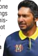
Former Sri Lanka captain —Kumar Sangakkara

If you take racism and discrimination in the world, one of the most important things is to teach your children history as it should be and not the sanitised version of it.