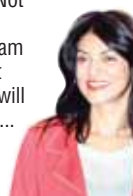
Actor —Sushmita Sen