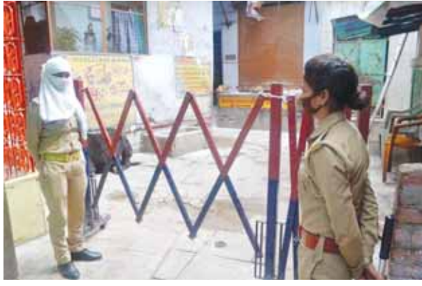
Security at hotspot Augustya Kund (Dashaswamedh) in Varanasi on Thursday

The district has crossed the 1600-mark as 67 new corona patients have been detected on Thursday. With this, the total number of patients has increased to 1,643. The day also saw one more death, increasing the toll of 37. The only relief is that during the day, the follow-up reports of 73 patients were found negative and later on, they have been discharged from the hospitals. With this, the total number of patients who have been recovered has increased to 763, leaving 843 active patients.