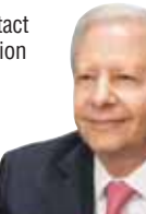
US Ambassador to India —Ken Juster

The Trump administration has maintained close contact and tremendous cooperation with India on the latest Chinese border aggression.