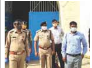
Wednesday. During their visit the officers inspected the barracks, hospital as well as the kitchen. The DM directed the jail superintendent to ensure