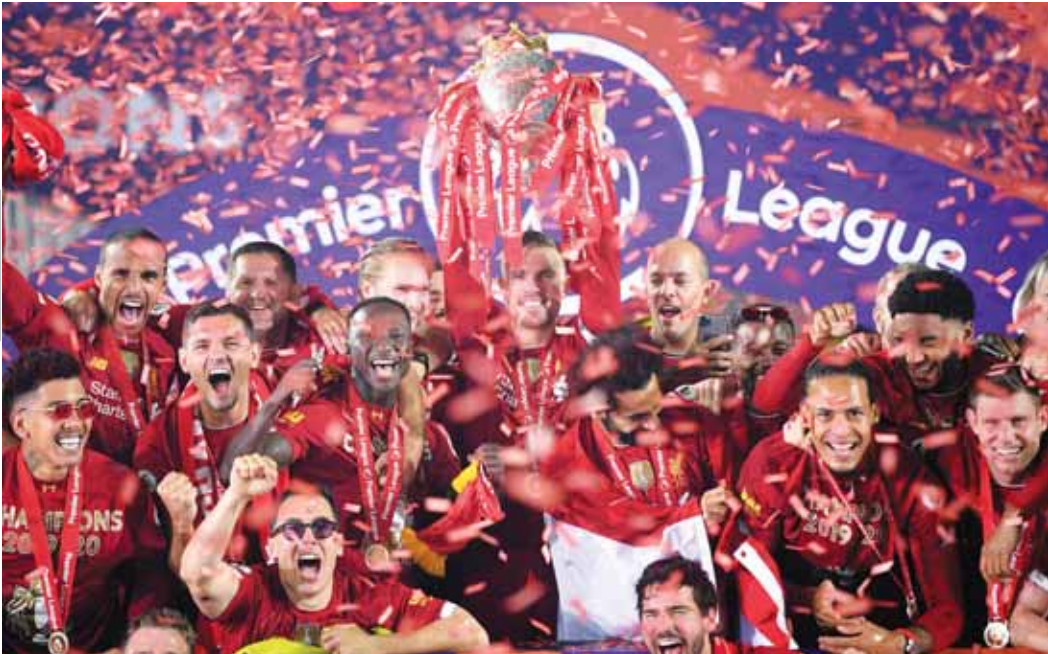
Liverpool players celebrate with the Premier League trophy after they beat Chelsea 5-3 in the final home game of the 2019-2020 season

Despite pleas for fans to stay away on the night Liverpool finally got their hands on the trophy, supporters crowded around the stadium even prior to kick-off, while the second half was accompanied by the