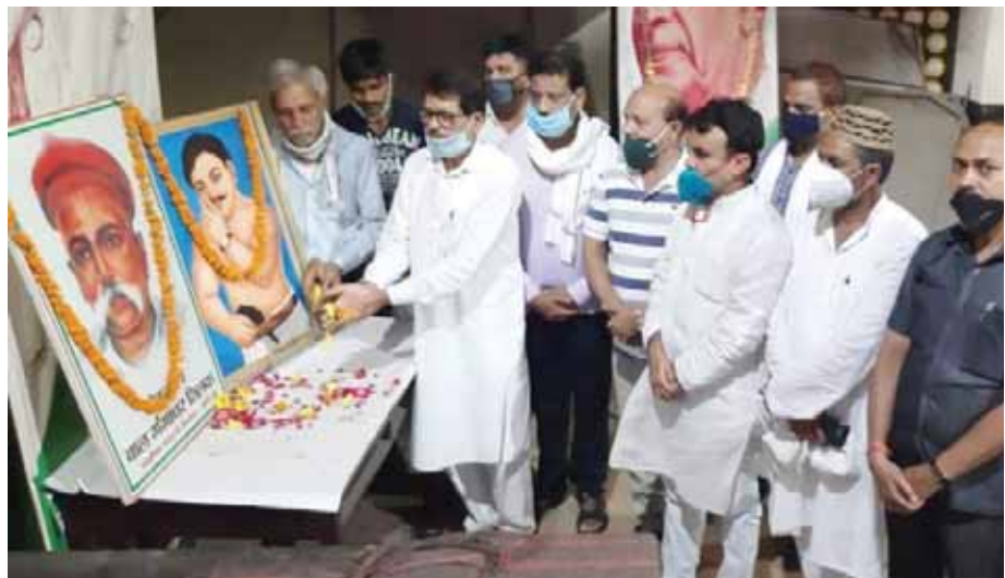
Congressmen pay homage to Bal Ganga Tilak and Chandra Shekhar Azad on their birth anniversaries at Tilak Hall on Thursday