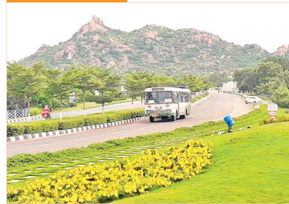
Road towards Yadadri wears a lush green look, thanks to Hyderabad Metropolitan Development Authority for taking up greenery and beautification works on the road medians covering 30-km from Ghatkesar Outer Ring Road till Yadadri