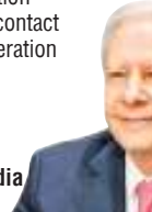
US Ambassador to India —Ken Juster

The Trump administration has maintained close contact and tremendous cooperation with India on the latest Chinese border aggression.