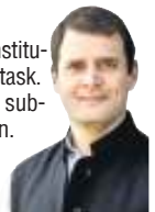
Congress leader —Rahul Gandhi

PM Modi is 100 per cent focussed on building his image. India's captured institutions are busy doing this task. One man's image is not a substitute for a national vision.