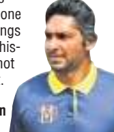
Former Sri Lanka captain —Kumar Sangakkara

If you take racism and discrimination in the world, one of the most important things is to teach your children history as it should be and not the sanitised version of it.