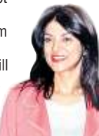
Actor —Sushmita Sen