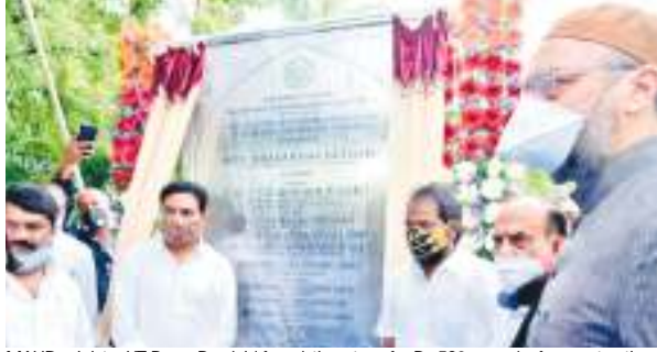
MAUD minister KT Rama Rao laid foundation stone for Rs 523 cr works for constructing flyover between Nalgonda X roads and Owaisi Hospital Centre on Thursday

The elevated corridor will be passing through Chanchalguda