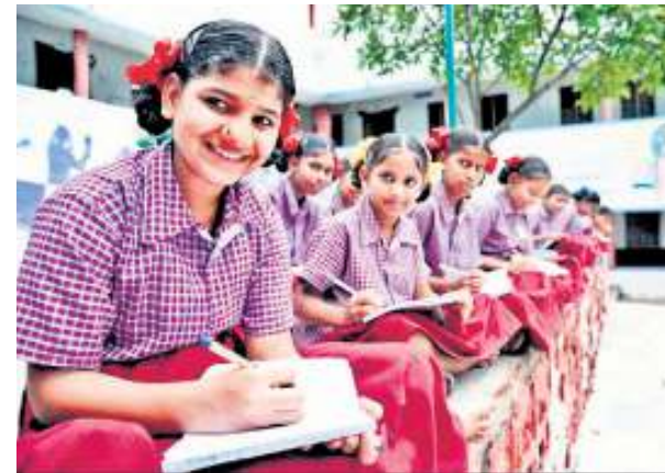
Though the idea is meant for students of TSWREIS and TTWREIS, children of other schools are also participating in the VLC

At a time when there are no clear-cut guidelines on conducting online classes in Telangana, students of the state social and tribal welfare residential educational institutions have turned teachers for their classmates.