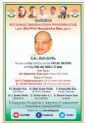
feelings to admire PV's contribution as befitting that of a