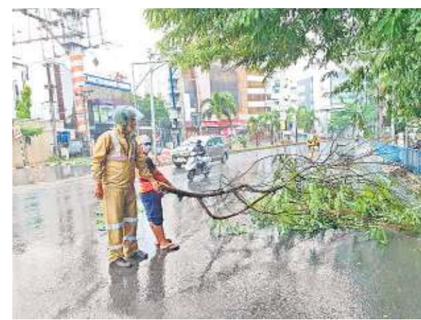
IMD issued heavy rain alert along with thunderstorm warning for parts of Telangana for two days

Besides Hyderabad, elsewhere in the state, Vikarabad received constant rainfall since