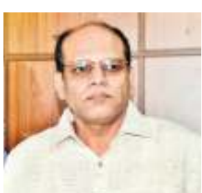
'insignificant' posts at a time when some retired officials as well as blue-eyed babus junior

Several senior IAS officers have been kept in the loop line by the state government which has posted them in what are deemed in official circles as