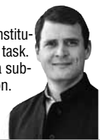
Congress leader —Rahul Gandhi

PM Modi is 100 per cent focussed on building his image. India's captured institutions are busy doing this task. One man's image is not a substitute for a national vision.