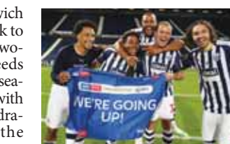
Brentford will go into the play-offs along with Fulham and Cardiff City but in a huge swing in fortunes, Nottingham Forest missed out on goal difference the last slot in astonishing fashion.

A win for Brentford would have sent them into the top division for the first time since 1947.