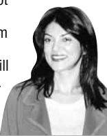
Actor —Sushmita Sen