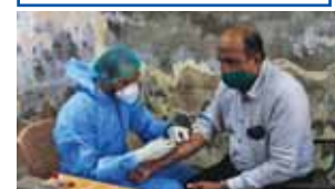
Police officer who tested positive for Covid-19 after recovery.

However, on July 10, he again felt unwell with a fever and dry cough and got himself tested on July 13.