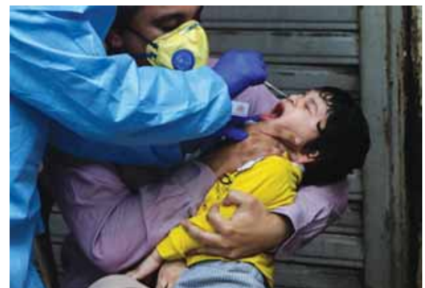
A health worker takes a swab sample of a boy for Covid-19 test at medical camp in Mumbai on Thursday

The State faced huge criticism for not carrying out adequate number of test to track positive cases. Even now it is one of the worst States as far as testing numbers go.