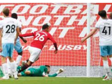
placed Chelsea on goal difference after the Blues lost 5-3 later at champions Liverpool. United will finish in the

top four if they draw or win in their decisive showdown with fifth-placed Leicester on Sunday.