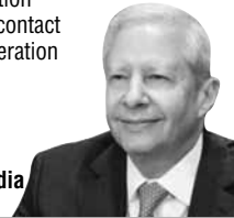
US Ambassador to India —Ken Juster

The Trump administration has maintained close contact and tremendous cooperation with India on the latest Chinese border aggression.