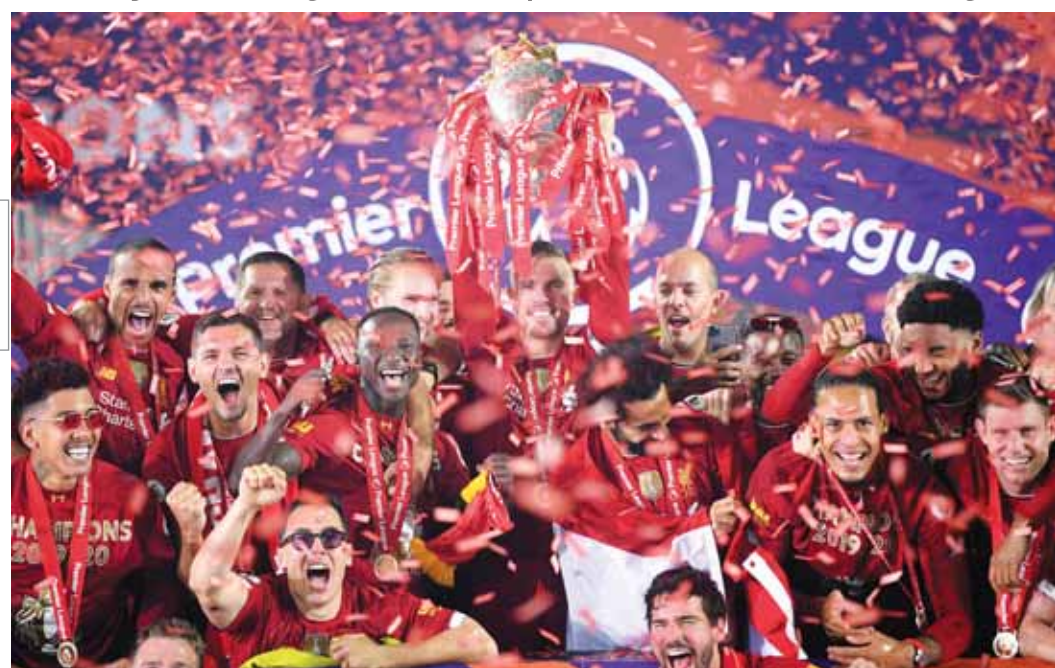
Liverpool players celebrate with the Premier League trophy after they beat Chelsea 5-3 in the final home game of the 2019-2020 season

Despite pleas for fans to stay away on the night Liverpool finally got their hands on the trophy, supporters crowded around the stadium even prior to kick-off, while the second half was accompanied by the