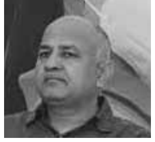
per in Humanities.

Setting a target to achieve 100 per cent results in Delhi Government schools, Deputy Chief Minister and education minister Manish Sisodia on Thursday interacted with some of the Class XII standard students placed under 'Essential Repeat' category to take their feedback and assured assistance to achieve better results for next year.