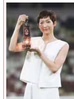
Japanese swimmer Ikee Rikako holding the lantern containing Olympic flame poses during a photo session at the Olympic Stadium in Tokyo

Besides this, Anu Raghavan's fourth-place finish in the women's 400m hurdles event has been upgraded to