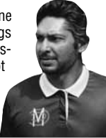
Former Sri Lanka captain —Kumar Sangakkara

If you take racism and discrimination in the world, one of the most important things is to teach your children history as it should be and not the sanitised version of it.