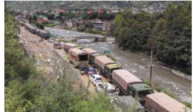
Army vehicles move towards Leh along the Manali-Leh highway amid the ongoing India-China border dispute, in Kullu district