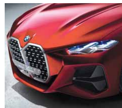
Can you spot the similarity?

When I look at some modern cars, I get reminded of sharks. If you, like me, are an amateur shark scientist and loved Discovery Channel's Shark Week shows, you would know that there are over a thousand species of them. When you think of sharks, you tend to think of the Great White, leaping into the air a seal tightly grasped inside its jaw. Isn't it? The fact is that the 'agape' look on so many car grilles that I see today, reminds me of the Whale, the largest fish in the world. An impressive one, of course, but thoroughly harmless with a massive mouth at the tip of its head, not below like predatory sharks, but at the tip.