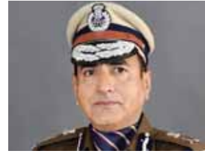
dlers and other offenders from the state."