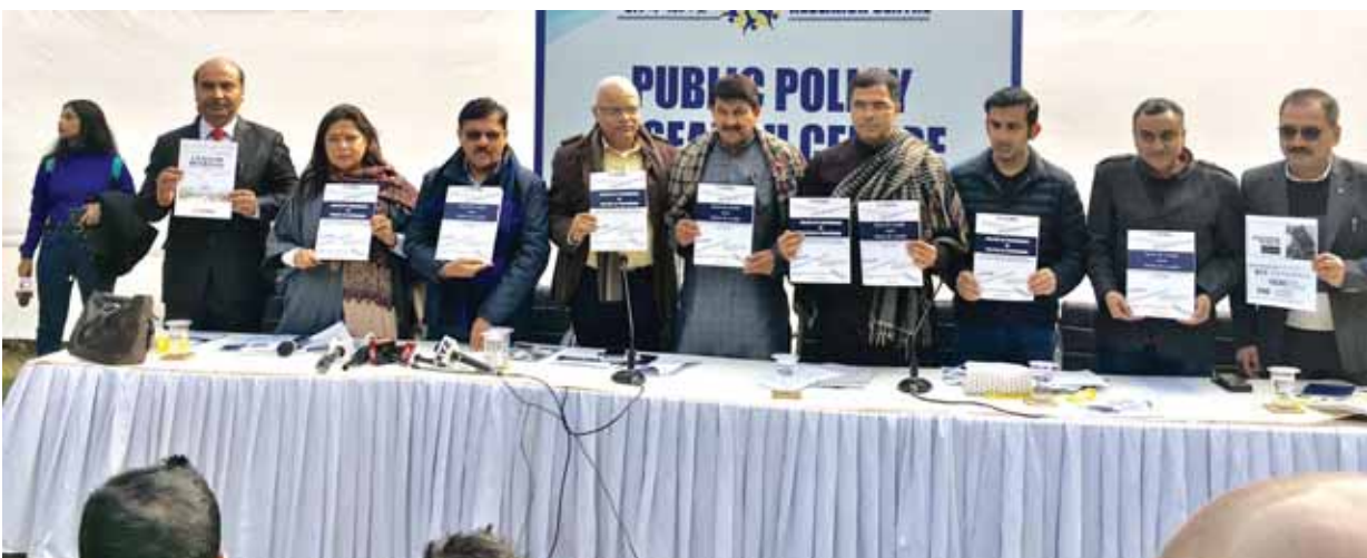
Member of Parliament Vinay Sahasrabudhe, along with sitting MPs, releases a report on Delhi Government schools in Delhi