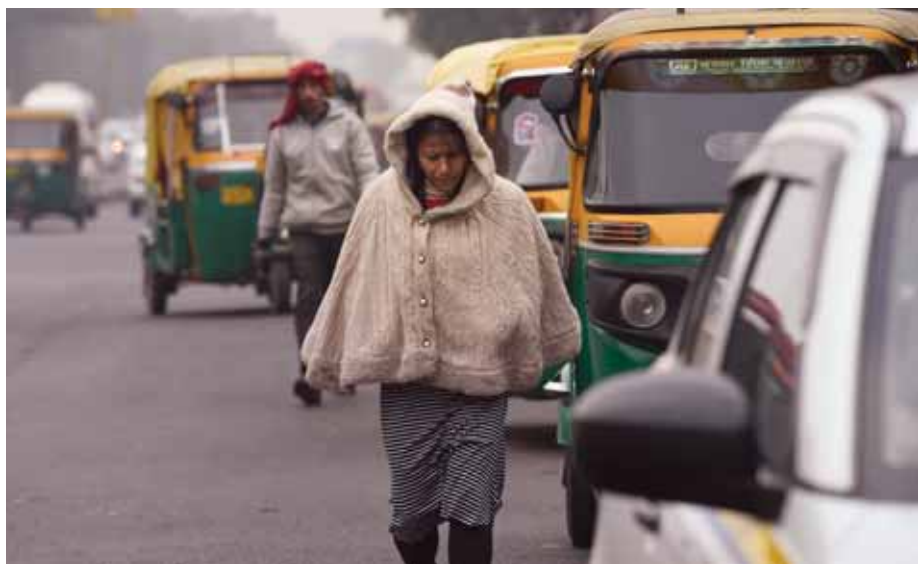
A woman wearing warm clothes walks on a road during a cold wintry morning in New Delhi on Friday

Meanwhile, Delhi which has been witnessing the longest December cold spell since 1997, recorded a high of 13.4 degrees Celsius, which was