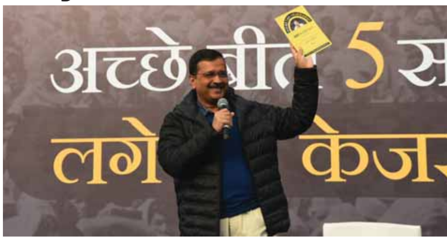
Chief Minister Arvind Kejriwal during his interaction with people on Friday

Echoing the rights of street vendors, Kejriwal said, "I am happy as survey has been initiated. We often hear about incidents where street vendors are removed from their places by the authorities." "In countries other than India, street vendors are encouraged because it is a source of employment for the people living there. Governments should work towards providing employment rather than