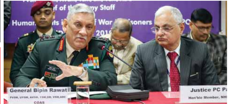
Army Chief Bipin Rawat addresses interns and senior officers of the National Human Rights Commission (NHRC) on the topic of Preserving Human Rights in Times of War and Prisoners of War at the Manav Adhikar Bhawan in New Delhi on Friday.