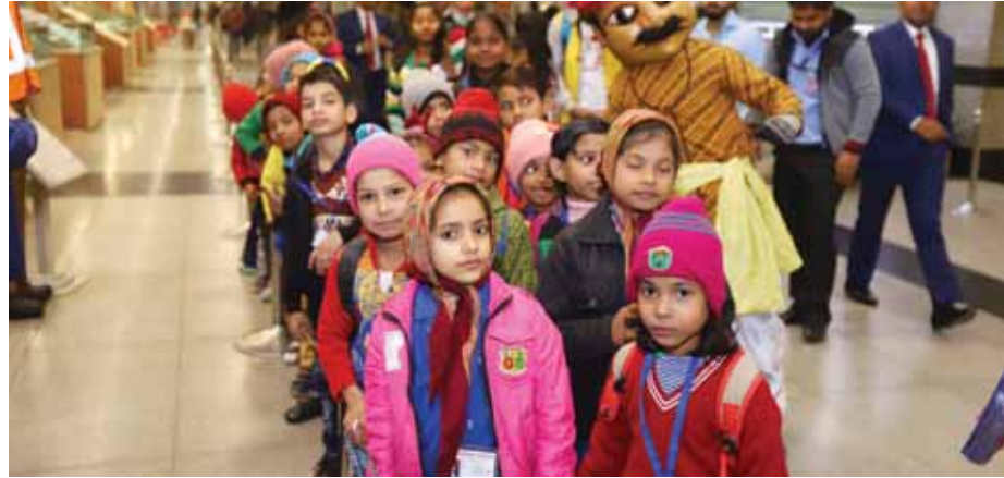
Children at DMRC museum

"With the passing time, the Museum has also been the venue for various events and