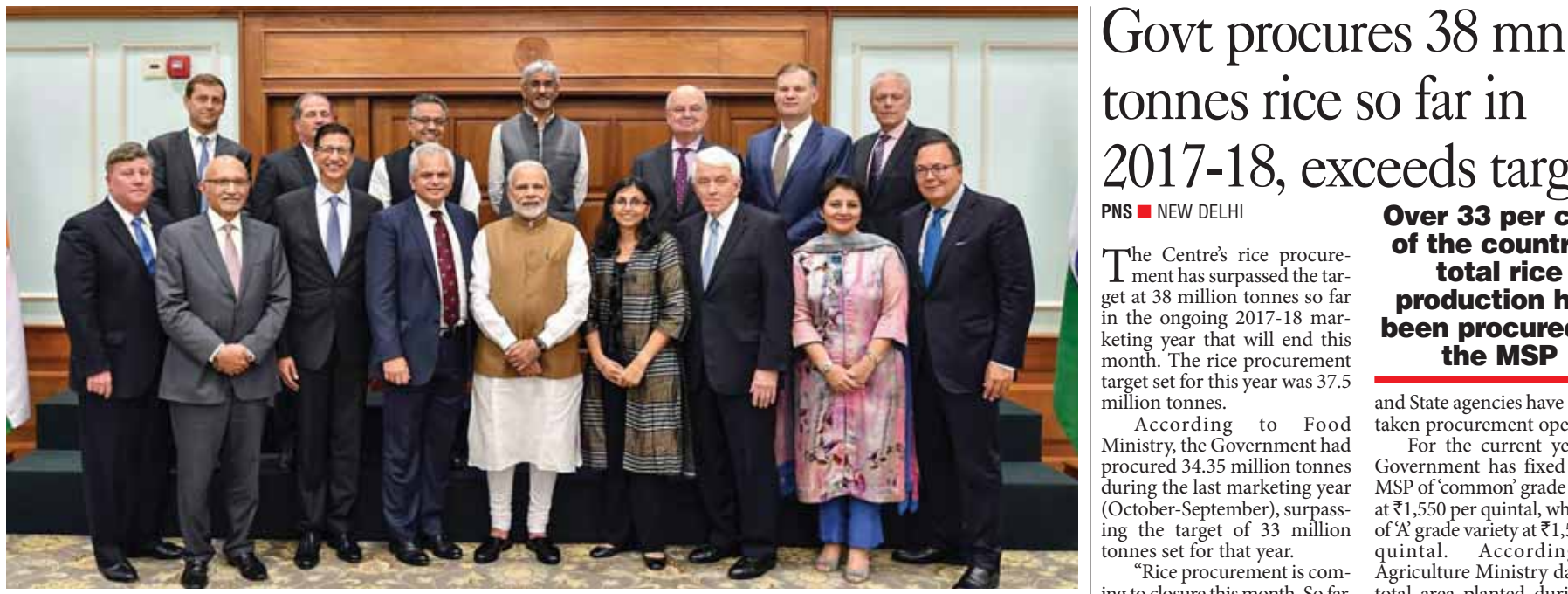
Prime Minister Narendra Modi with board members of United States India Business Council (USIBC) in New Delhi on Friday